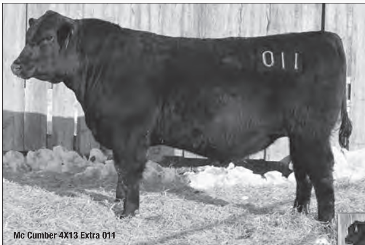
Mc Cumber 4X13 Extra 011