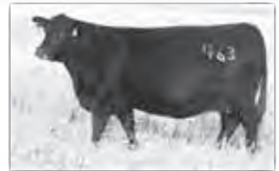
Dam • B Pride 463 of Mc Cumber

We have 829 calves on the ground and expect to use him even heavier, however 058 has excelled at nearly every measure and his dam is backed by an outstanding maternal heritage.