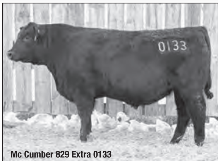
Mc Cumber 829 Extra 0133