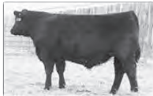
Maternal brother • Mc Cumber 582 RT Time 9258

WWR 4@102 and is the Grand dam to the excellent Missing Link son selling as Lot 27 in this sale. This light birth calving ease prospect is stacked with many generations of top cow makers including 6595 2 times, 044, Right Time, AAR New Trend, 054 2 times, Viking, and 376.