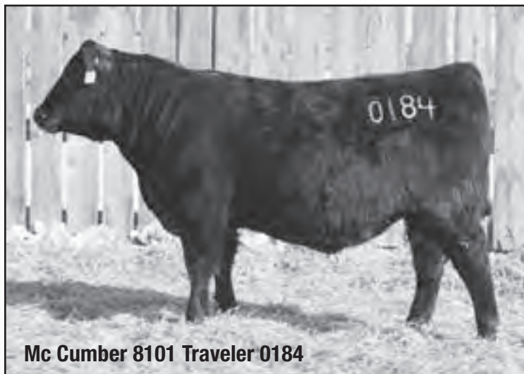
Mc Cumber 8101 Traveler 0184