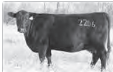
Dam • Erianna 2206 of Mc Cumber

Selling ½ interest and full possession- You've heard the phrase "Butt, Guts, and Nuts"? Well 005 epitomizes this phrase, he is an absolute tank with an abundance of muscle down his top which he carries out into a large expressive hip and hind quarter. He is a large scrotaled bull that possesses as much depth of body, and natural thickness as you will find. This masculine, muscular, moderate beef bull performed well with an actual weaning weight of 755lbs. and weighed right along the bigger framed bulls at a year with an actual YW of 1216 lbs. and earned a 365 day weight of 1261 lbs. In addition to this he scanned the largest REA of 14.8 to ratio 112 in his ET contemporary group. He stands down square on his feet and legs and tracks wide and true as he travels. His pathfinder donor dam is a powerful, deep bodied, easy fleshing daughter of Mc Cumber 6122 Equator 8113. She has produced many top progeny for us and one of her sons includes the 2007 sale topper Mc Cumber 004 Traveler 6120 who sold to Kemnitz Angus in SD. In our 2009 female sale they also purchased Erianna 2206 of Mc Cumber as one of the top selling females of that sale. She has produced many daughters that have been