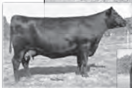
Maternal Grand dam to Lot 1 • Oak Hill Miss Wix 9402