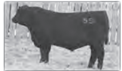
Full brother to dam • Mc Cumber Total Value 551

a 365 day weight of 1224 lbs. His dam is a moderate framed, easy fleshing full sister to Mc Cumber Total Value 551, and a maternal sister to the herd bull prospect selling as Lot 4 in this sale. B Pride 6107 is sound footed, docile, and produced one other son that sold to Bar V in ND.