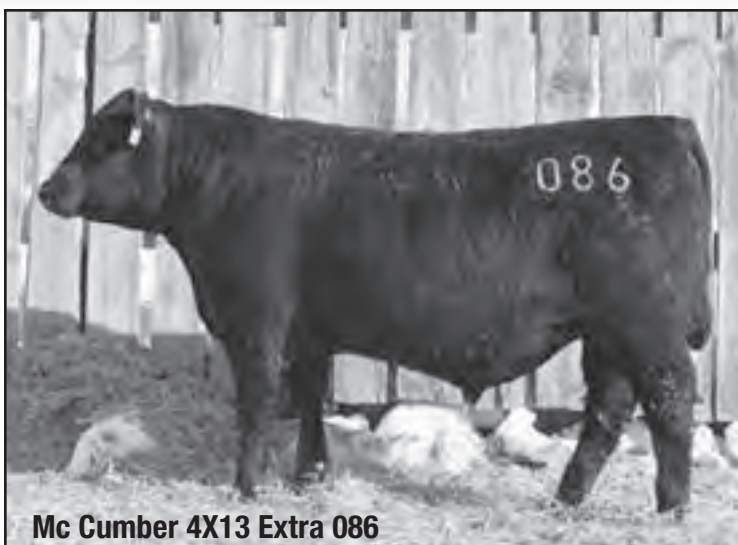
Mc Cumber 4X13 Extra 086