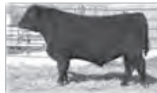
Full Brother • Mc Cumber 4X13 Extra 9180