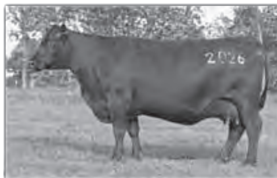
Grand dam • Miss Wix 2026 of Mc Cumber

This young bull had outstanding post weaning performance with an ADG of 3.58 lbs/day to ratio 103, and a 365 day weight of 1231 lbs to ratio 101. 0207 is long bodied, smooth fronted, and thick quartered. His dam is a neat uddered, moderate framed, easy fleshing daughter of Mc Cumber 7078 VRD 3108.