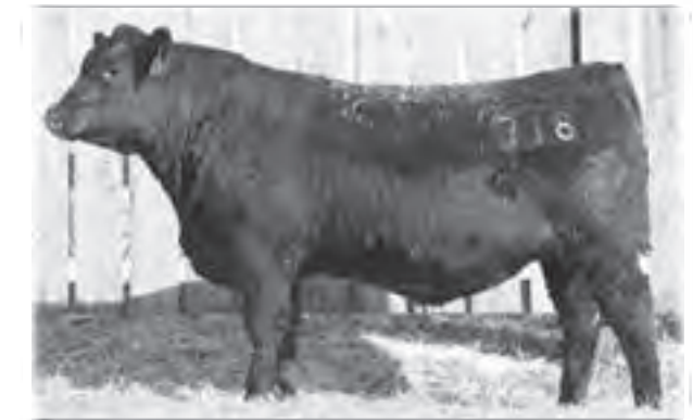
Mc Cumber 4X13 Extra 718