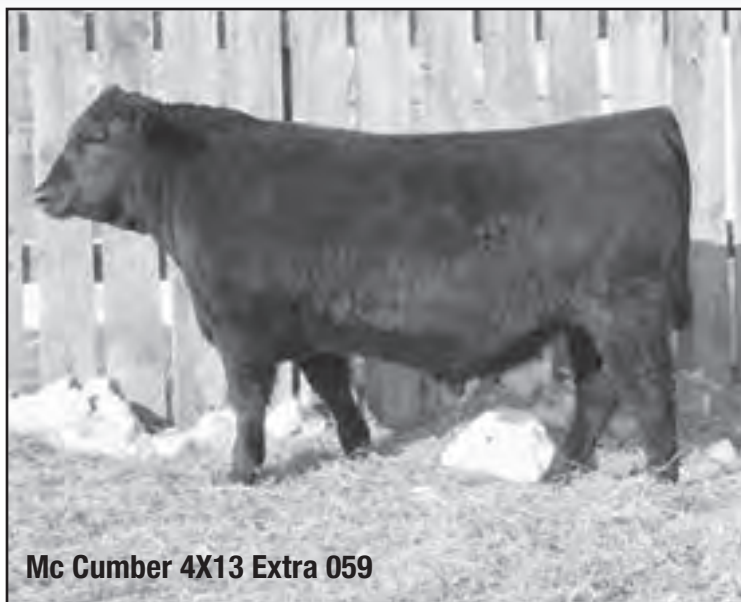
Mc Cumber 4X13 Extra 059

This top son of 4X13 has the credentials to move your herd in a positive direction. He combines early growth, calving ease and carcass into a complete package with more muscle and stoutness than the average 4x13.