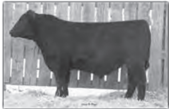
Maternal brother to dam • Mc Cumber 2700 RT Time 810

A high-gaining, wide made son of our 2009 sale topper Mc Cumber 383 Tradition 8134 with extra stoutness, and length of body. He gained 3.81 lbs/day to ratio 111, and earned a 365 day weight of 1279 lbs to ratio 105. His IMF is very good as well with an IMF of 4.18 to ratio 119. His feminine fronted, neat uddered dam is off to a good start with a WWR 2@103, YWR 2@106, and IMF 2@118. She has produced one other son that sold to Dustin and Robyn Dunlap in last year's sale.