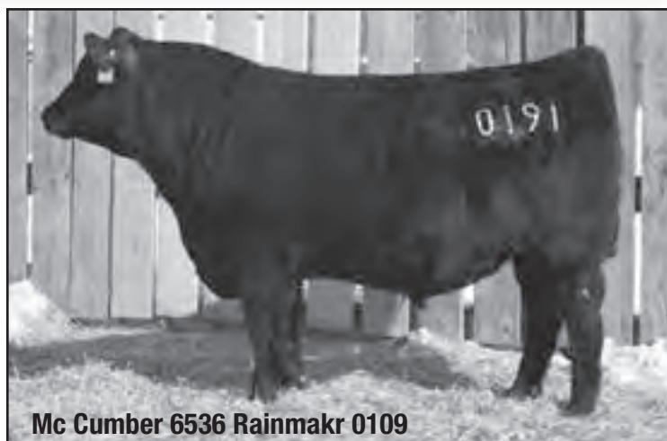
Mc Cumber 6536 Rainmakr 0191

0026 is a super complete, good performing son of Coleman Emblazon 780 with above average performance across the board. He scanned well with a REA of 13.9 to ratio 114, and has a masculine, muscular look about him. His dam is a good uddered, easy fleshing daughter of S Right Time