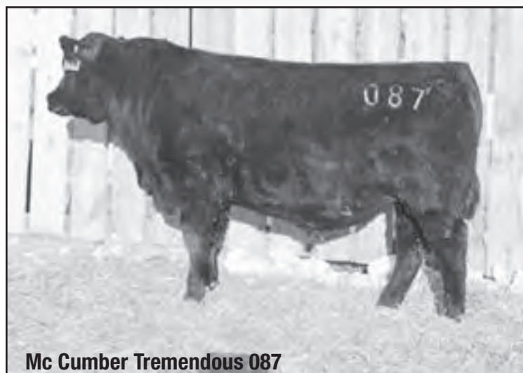
Mc Cumber Tremendous 087