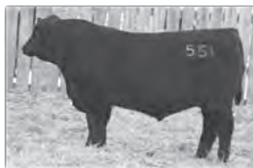
Maternal Brother • Mc Cumber Total Value 551

Selling 2/3 interest and full possession- A phenotypic standout and possibly the best 004 son we have bred. 001 is thick from end to end. He is wide based and abounding with muscle. He has the herd bull look and has been a favorite all winter. 001 is a masculine, beef bull that is sound structured, good footed, and deep from fore rib to flank. He weaned off his recipient dam at 800lbs. gained 3.67 lbs/day and earned a 365 day weight of 1322 lbs. In addition he scanned a REA of 14.0 and possesses the added muscle and rib dimension demanded by cattlemen today. His pathfinder donor dam is a high volume, wide made daughter of Sitz Traveler 9929. She is good uddered, and sound on her feet and legs. She has been very productive with a BWR 7@101, WWR 7@106, YWR 5@104, and a REA 19@102. She was a feature of a past Female sale selling to Fortune's Rafter U Cross Ranch in SD where she is still in production at the age of 12. She has produced several sons that have sold through past Mc Cumber Bull Sales which include Mc Cumber Total Value 551 who sold to Lindskov Angus in SD and was used back here at