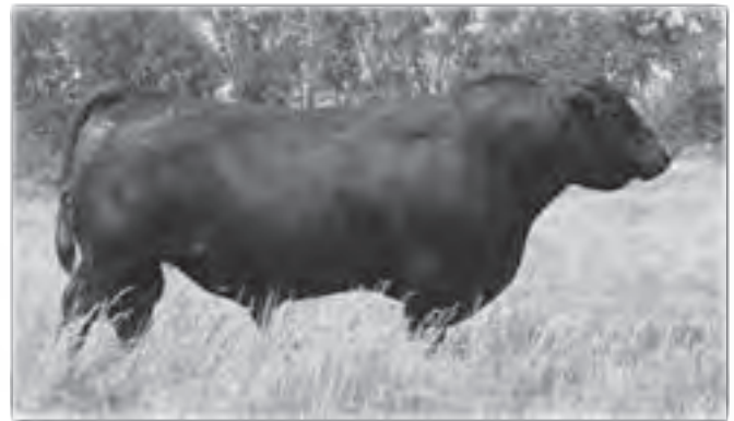
O C C Tremendous 619T