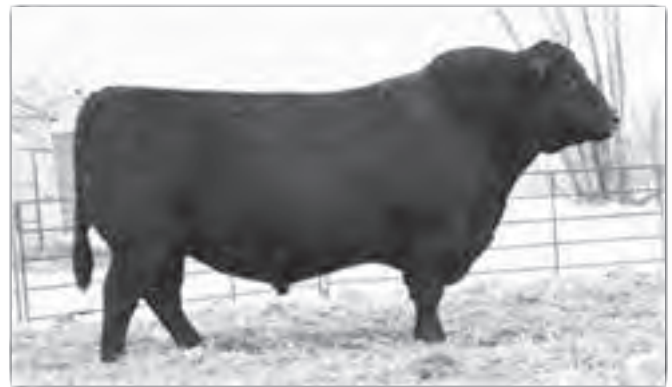
Sitz JLS Emulation EXT 536P