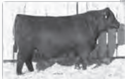
Mc Cumber Missing Link 911 produced by full sister to dam