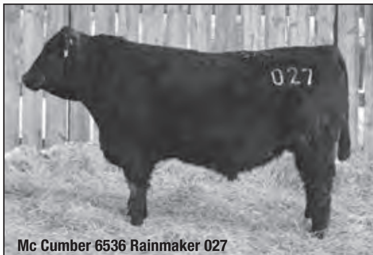
Mc Cumber 6536 Rainmaker 027

Recommended for use on heifers- 027 is a ruggedly built, deep ribbed, long bodied Rainmaker 6536. He weaned off his pathfinder Right Time dam at 750 lbs and should be a safe bet on heifers. His deep bodied, easy fleshing dam has been a very light birth, productive cow. She has had 5 calves with an average birth weight of 76 lbs, and has a BWR of 5@93. Along with this, her production has been very good as well, with a WWR 5@105, and YWR 5@103. Her pedigree is stacked with proven, problem free bulls like Right Time, Mc Cumber 124 Traveler 212, Rito 054, and 376. Her first daughter in production here weaned our high indexing heifer this fall, and has weaned 3 calves with a nursing ratio of 116. One of those calves was the 6536 heifer featured in our 2009 Female sale that sold to Terry Little in MO.