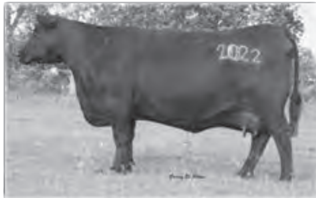
Great Grand dam Miss Wix 2022 of Mc Cumber