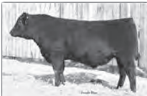
Mc Cumber Missing Link 9104 produced by full sister

This calving ease, cow maker herd sire prospect is the result of mating proven genetics that are predictable, problem free cattle that have withstood the test of time.