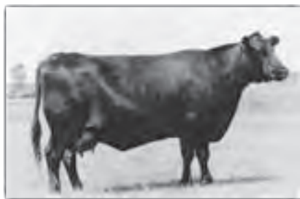
Great Grand dam • Miss Wix 365 of Mc Cumber

Recommended for use on heifers- 054 is a light birth, calving ease prospect sired by 536P. His maternally packed pedigree should ensure his ability to sire outstanding females. His dam is a grand daughter of Miss Wix 365 and displays the outstanding fertility and productivity the Miss Wix cow family is known for. Miss Wix 503 of Mc Cumber has never