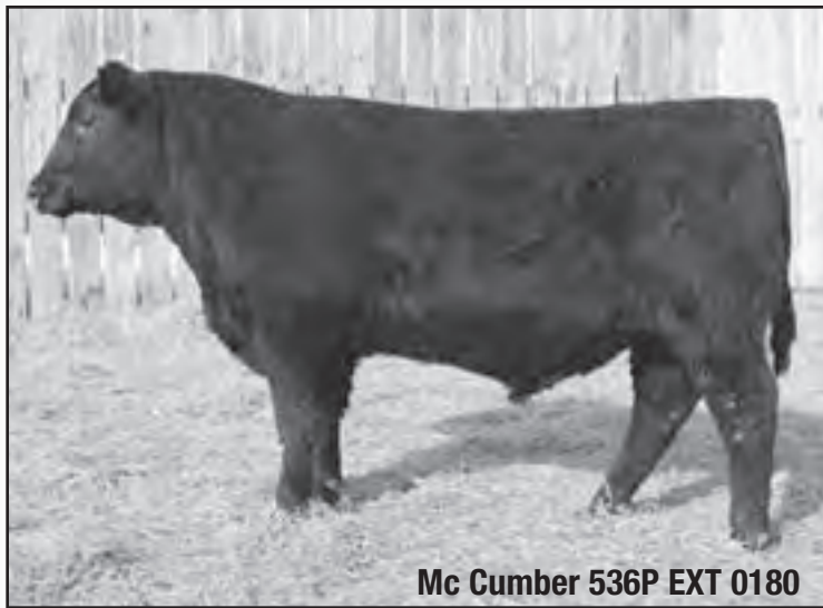
Mc Cumber 536P EXT 0180