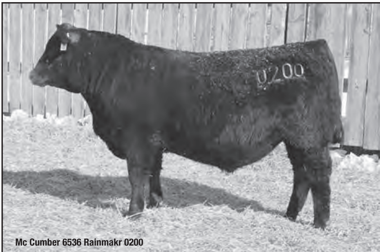
Mc Cumber 6536 Rainmakr 0200