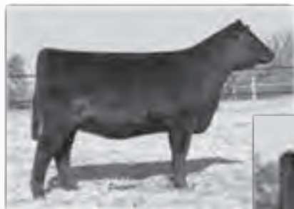
Gale 02 of Mc Cumber

Recommended for use on heifers- Here is a real chunk by O C C Paxton 730P. 052 is a masculine, muscular, beef bull with calving ease credentials. He had a REA of 13.2 to ratio 106 and earned a REA/CWT of 1.29. You will definitely notice the extra muscle expression he displays. His dam is a fertile, good uddered daughter of LT Timberwolf 5014. This light birth weight bull is bred to ensure forage efficient, easy fleshing, problem free females.