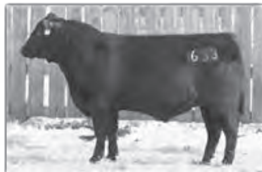
Maternal brother to Lot 35 • Mc Cumber 449 T Value 633