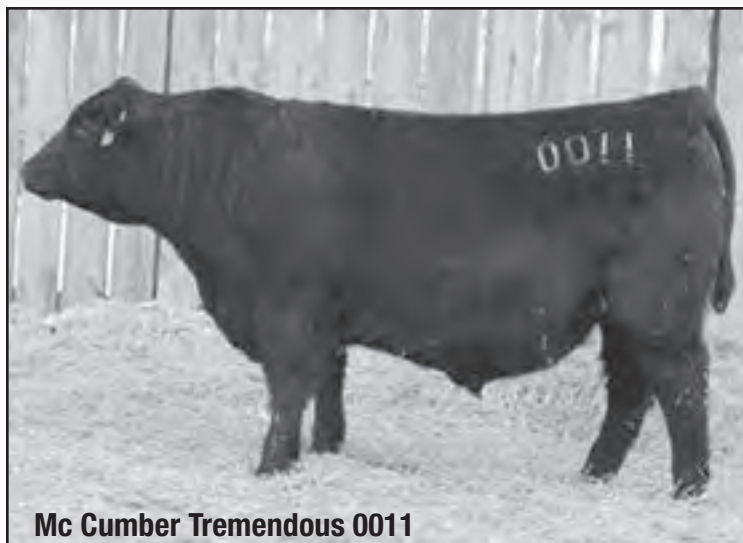
Mc Cumber Tremendous 0011