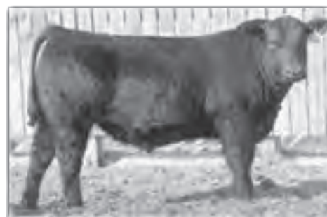
Maternal brother to Lot 35 • Mc Cumber 536P EXT 8194