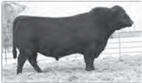
Sire • Sitz JLS Emulation EXT 536P

0106 has the bred in ability to sire fertile, good uddered, easy fleshing females that would benefit even the top cowherds. This calving ease prospect is one to find.