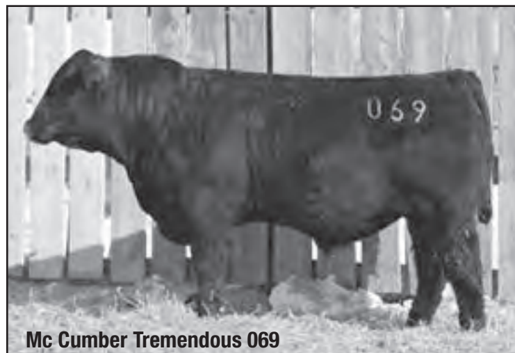
Mc Cumber Tremendous 069

This bulls unique good looks, extra muscle, and stoutness is sure to make him a sale day favorite.