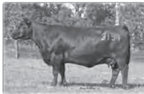
Maternal Grand dam • Miss Wix 3154 of Mc Cumber

Recommended for use on heifers- 041 is another light birth, good gaining son of Rainmaker 6536. He is a well made, moderate framed bull with plenty of depth and thickness. This calving ease Rainmaker had only a 70 lb birth weight, and has a CED of +11 and BW EPD of -0.8. His dam is a modest framed daughter of 004 and has been a consistently light birth weight female with a BWR of 2@78, and an average birth weight of 68 lbs on 3 calves. She has never missed by AI and has a calving interval of 3@358.