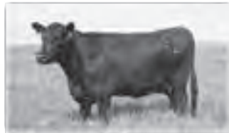
Dam • Lassie 521 of Mc Cumber