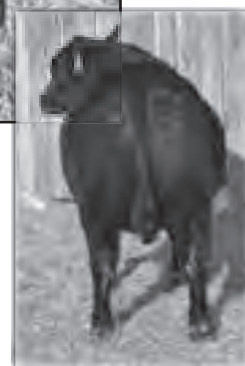
Maternal brother to dam • Mc Cumber 4X13 Extra 975