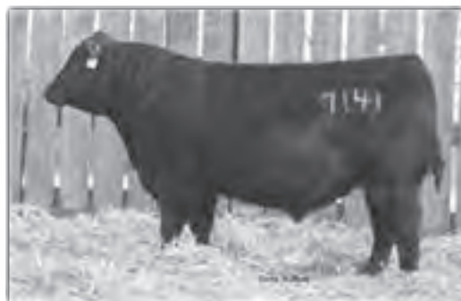
Maternal brother to dam • Mc Cumber Timberwolf 7141

This legitimate beef bull could really sire a stout set of steers, and females with longevity, adaptability, and fleshing ease.