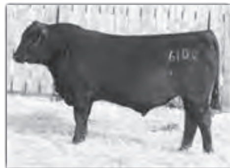
Maternal brother • Mc Cumber Valubull 6100

0139 is produced from multiple generations of top cows, thus ensuring his ability to consistently sire productive, fertile, problem free females and males with added performance.