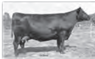
Grand dam • Oak Hill Miss Wix 9402