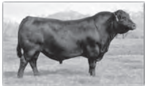
Sire • Coleman Emblazon 780

Recommended for use on heifers- 0023 is another masculine, deep bodied, wide based son of Coleman Emblazon 780. He had a REA of 12.8 to ratio 105 and gained 3.51 lbs/day on test. His dam is a light birth, productive daughter of Mc Cumber Total Value 449 who is leaving a nice set of daughters here at Mc Cumber. Gale 690 has a BWR 2@98, WWR 2@103, YWR 2@103, and REA 2@100.