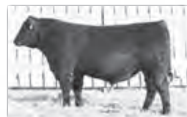
Maternal brother • Mc Cumber 4X13 Extra 978

019 is a unique combination of calving ease, and forage efficiency in a very stylish clean made package.