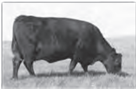
Great Grand dam • Gale 1124 of Mc Cumber

Selling 2/3 interest and full possession- Recommended for use on heifers- I had a customer ask for a butane tank on legs one time. Well this is as close as we have gotten. 0011 is a real load. This moderate framed, tremendously deep bodied calving ease herd bull prospect weaned and weighed off test right with bulls with quite a bit more frame. 0011 weaned off at nearly 800 lbs. as his dam's first calf and earned nearly a 1300 lb. 365 day weight, while only starting life at 69 lbs. This big bodied, wide made bull has attracted some looks because of his overall mass. I would call him a changer and without a doubt the kind that would thrive in a forage environment. He possesses the capacity to consume enough forage to perform in a grass environment. His 4x13 dam is neat uddered with small well placed teats, and snug attachment. She is produced from 3 consecutive generations of Gale pathfinders and is off to good start as well.