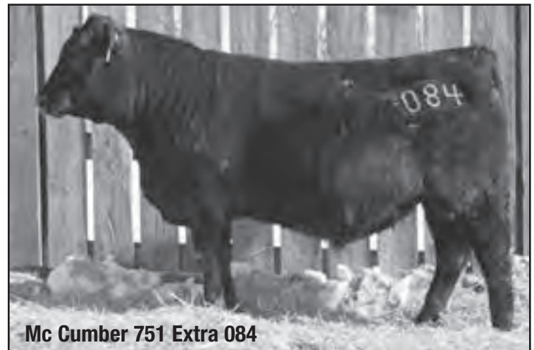
Mc Cumber 751 Extra 084