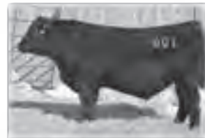
Full brother to dam Lot 4 • 001 Mc Cumber 004 Traveler 001

0188 should be one cow making sun of a gun. He is a deep bodied, wide made son of 536P with extra stoutness, and masculinity. He earned a WWR of 102 and is produced from a big bodied, easy fleshing, stout made full sister to the herd bull prospects selling as Lot 4 and 22 in this sale. The 536P X 004 mating has been successful in producing females with fleshing ease, natural thickness, and udder quality.