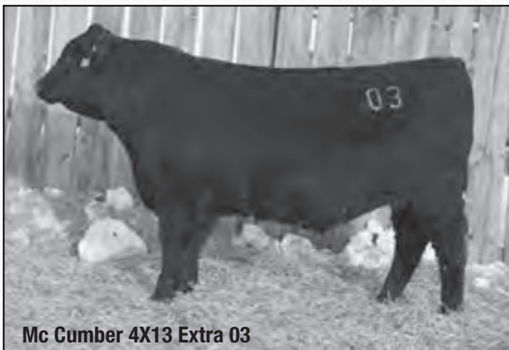
Mc Cumber 4X13 Extra 03

03 has a proven pedigree for predictable, problem free cattle.