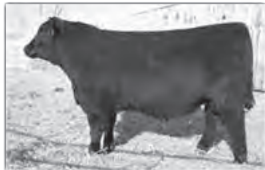
Maternal brother • Mc Cumber 4X13 Extra 9137

Selling 2/3 interest and full possession- This stout made, super stylish son of Coleman Emblazon 780, will catch your eye with his extra muscle expression, big scrotal, and good looks. 085 just misses our parameters as a calving ease bull, but after a year on cows to see how he calves, he may well work on heifers. He earned a WWR of 104 as his dam's second calf and has been catching my eye all winter. Emblazon 780 was the high selling bull in Coleman's 2009 sale to Circle V Ranch in ND. 780's dam is a full sister to our resident herd sire 536P, and is an impressive, powerful female whose progeny have consistently been some of the highest valued cattle in past Coleman sales. 085's dam has been a no miss female and is a highly productive, fertile daughter of Mc Cumber Total Value 449. She produced one of the top 4x13 sons in last year's bull sale selling to Marohl's Yellow Top Angus in ND, and is already nursing a super heifer calf by Mc Cumber Missing Link 9112 this year. She is well on her way to pathfinder status with a WWR of 2@107 and a YWR of 2@108. This is a good one with an outcross pedigree for most of our customers.