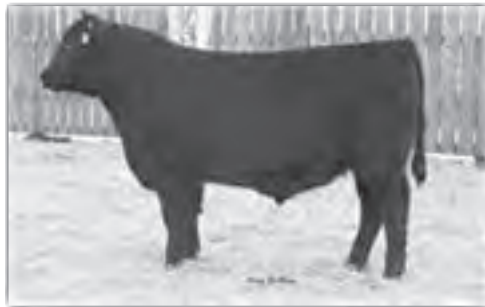
Maternal brother to dam • Mc Cumber 4X13 Extra 8013

Recommended for use on heifers- 0168 is a commercial bull, so if you plan on participating in the Angus Source program he will not work for you. 0168 is a masculine, meaty son of Rainmaker with excellent post weaning performance. He gained 3.88 lbs/day and earned a 365 day weight of 1230 lbs to ratio 105. His moderate framed, easy fleshing dam is neat uddered, good footed, and productive.