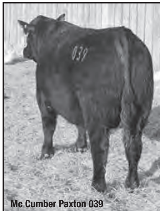
Mc Cumber Paxton 039

Selling 2/3 interest and full possession- Recommended for use on heifers- If your looking for one that excelled at every measure here he is. 039 weaned off his dam with a 205 day weight of 730 lbs to ratio 109, gained nearly 4.00 lbs/day to ratio 113, and earned a 365 day weight of 1359 lbs. to ratio 111. Along with this he had an IMF of 3.93 to ratio 112, and a REA of 12.9 to ratio 104 with a BF of only .27. In addition to his outstanding performance, and ultrasound, 039 is a deep bodied, heavy muscled bull with a big scrotal and the look of a beef bull. His dam is a highly productive daughter of Garrison Dynamite 8128,