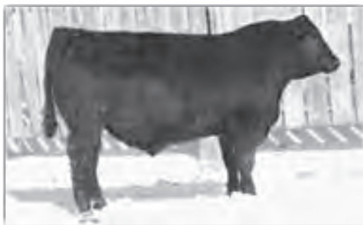
Maternal brother • Mc Cumber Valubull 6032

Recommended for use on heifers- 0020 is a heavy muscled, light birth son of Coleman Emblazon that earned one of the top 205 day weights of his contemporary group to ratio 107. He scanned a REA of 12.6 to ratio 103, and displays extra shape and expression to his top. His dam is an easy fleshing, good uddered daughter of Mc Cumber 8113 Equator 1190 with two sons selling for an average of over $3600 to Arne Domben, and Sidney Strelow in ND.