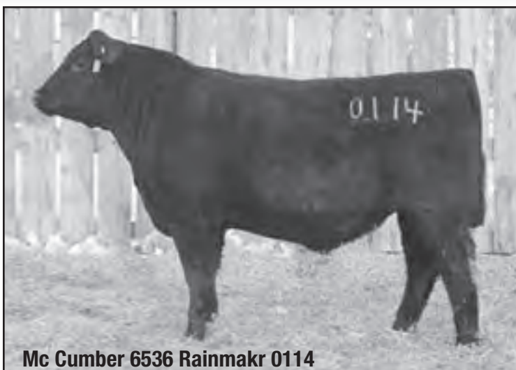
Mc Cumber 6536 Rainmakr 0114