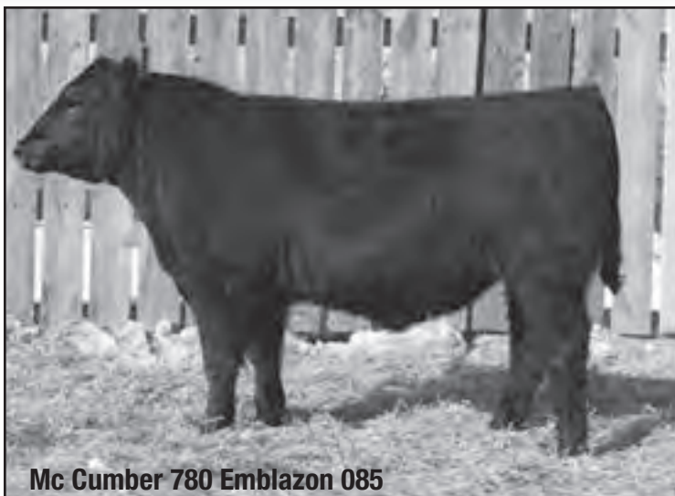
Mc Cumber 780 Emblazon 085

Chuck Tastad Family RR1 • Box 128 Rolette, ND 58366 Chuck (701) 246-3366 Matt (701) 246-3547 Email: mccumber@utma.com www.mccumberangus.com Located 1 mile west, 1/4 south of Rolette