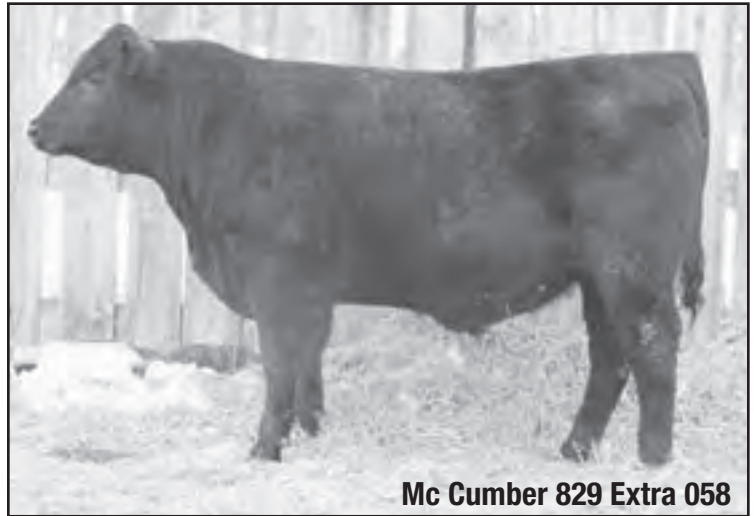
Mc Cumber 829 Extra 058

0180 would be near the top of my list for siring outstanding, problem free females.