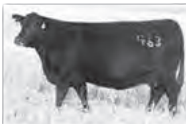
Maternal Grand dam • B Pride 463 of Mc Cumber

Selling ½ interest and full possession -Recommended for use on heifers-This long bodied, free stiding 4x13 son is one of the best to date. 011 is a wide based, sound structured, big scrotaled bull with outstanding post weaning performance in an efficient, moderate framed package. He came off his dam with an actual WW of 770 lbs. without creep and went on to gain 3.93 lbs/day on a 44 Mcal ration and earn a 365 day weight of 1331 lbs. to ratio 109. He scanned at or above average across the board on ultrasound, and puts together a well balanced tabulation. His outstanding dam is a powerful, easy fleshing, deep bodied, neat uddered daughter of Boyd New Day and is the top daughter in the herd by him. B Pride 636 was the top performing heifer of her calf crop, yet matured into a moderate, fertile, productive cow with a BWR of 2@95, WWR 2@107, YWR 2@108 and a calving interval of 4@362. Not only is his dam a top producer, but his Grand dam is B Pride 463 of Mc Cumber who has been one of the most productive, easiest fleshing, deepest bodied females on the Ranch. Her production, combined with outstanding fertility,