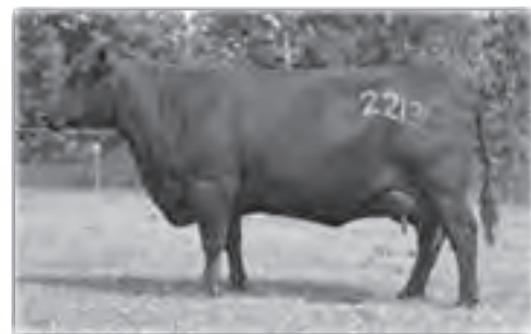
Grand dam • Blackcap 2213 of McCumber

Recommended for use on heifers- 088 is one of the high gaining bulls on test with an ADG of 4.15 to ratio 120. Along with this, he earned a 365 day weight of 1304 lbs to ratio 107, and had an IMF of 4.40 to ratio 126. His dam is a neat uddered daughter of Right Time, and member of the Blackcap family. This calving ease prospect is smooth shouldered, long bodied, and free moving.