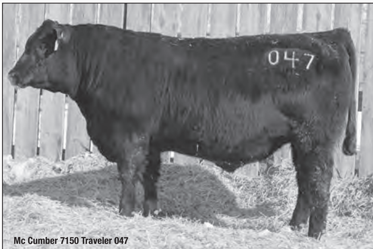
Mc Cumber 7150 Traveler 047