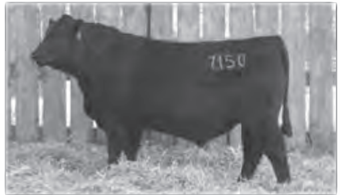
Mc Cumber Hard Drive 7150