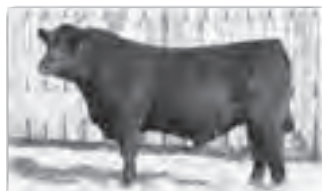
Maternal brother • Mc Cumber 4X13 Extra 982

0133 has not only the power and performance to add pay weight, but is stacked with generations of proven cows that have stood the test of time.