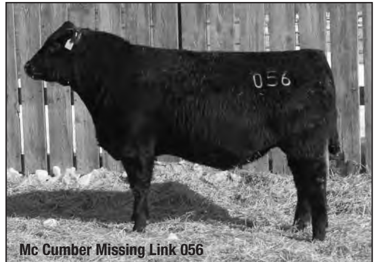
Mc Cumber Missing Link 056