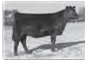
B Pride 030 of Mc Cumber an OCC Tremendous 619T daughter

Selling 2/3 interest and full possession- Recommended for use on heifers- Here is one stylish, smooth made, heavy muscled son of OCC Tremendous 619T. 0156 is sure to catch your eye. This thick quartered, square rumped, calving ease prospect weaned off his dam with a 205 day weight of 743 lbs. to ratio 111 as his dam's first calf. In addition, he earned a 365 day weight of 1284 lbs. to ratio 105 and had one of