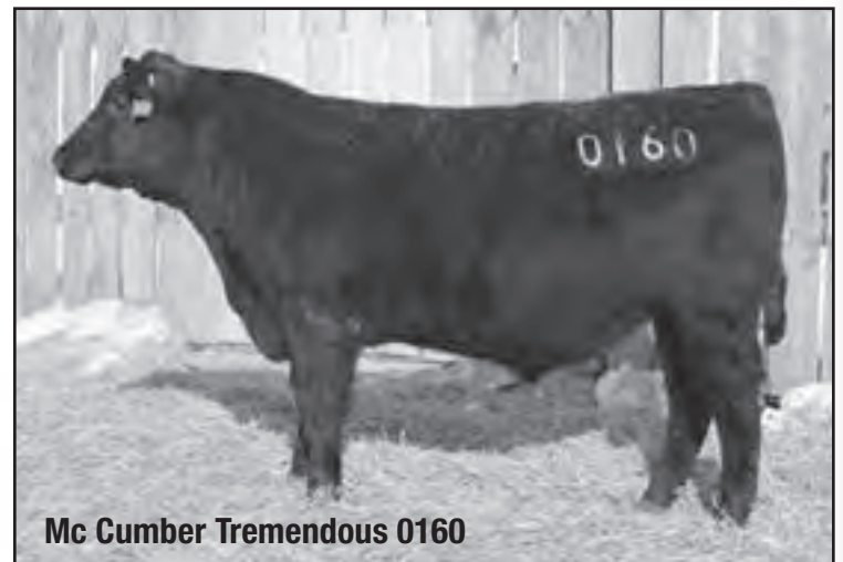
Mc Cumber Tremendous 0160

3@346. Additionally, she is a light birth weight cow with 3 calves with an average birth weight of 80 lbs and a BWR of 2@89. Her progeny scan consistently well for IMF with a ratio of 2@108. Her only daughter sired by Tremendous recently calved and is near perfect uddered, quiet dispositioned, and easy fleshing.