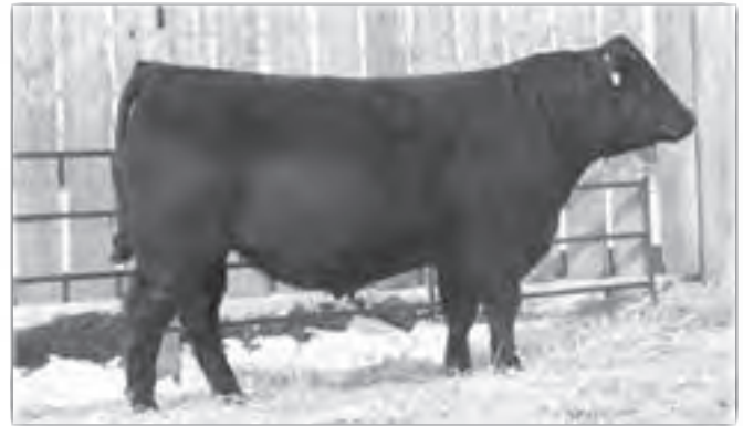
Mc Cumber 4X13 Extra 829