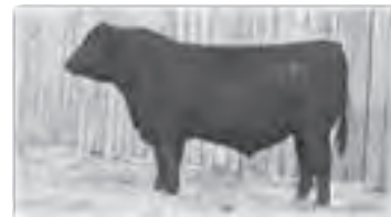
Full brother to dam • Mc Cumber 004 Traveler 513