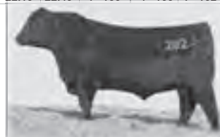
Sire of dam • Mc Cumber 6536 Rainmakr 0191

0191 is a big topped, wide based son of Rainmaker. In addition to this he is deep from fore rib to flank and stands down wide and square on his feet and legs. This March born bull scanned a REA of 13.0 to ratio 105 and performed above average on both ADG and YW. His double bred Miss Wix dam is a long bodied, easy fleshing daughter of Mc Cumber Classic 202.