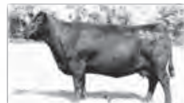
Grand dam • Lassie 587 of Mc Cumber