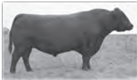
Sire • Sinclair Extra 4X13

Selling 2/3 interest and full possession- Recommended for use on heifers- 077 is an extra stout, long bodied son of Sinclair Extra 4X13. He has been a favorite of mine all year and is admired for his added muscle, length, and stoutness. Along with this, he has performed well across the board. He weaned off his outstanding dam at 755lbs. and earned a 205 day weight of 763 lbs. to ratio 114 as his dam's first calf. In addition, he earned a 365 day weight of nearly 1300 lbs. to 106 and scanned superbly with an IMF of 3.90 to ratio 111, and a REA of 13.1 to ratio 106. His dam is a top daughter of Right Time with a neat, well attached udder, excellent foot shape and structure, and along with her abundance of rib still has the femininity through her head and neck. She is a member of the Rosetta cow family and is the result of the progression our program. Her pedigree is stacked with proven cow makers that include Right Time, AAR New Trend, Rito 054, Shoshone Viking, and 376. Her pathfinder dam has been extremely productive as well with a WWR 7@105, and YWR 7@100. Her pathfinder Grand dam raised 14 calves with a WWR of 105.