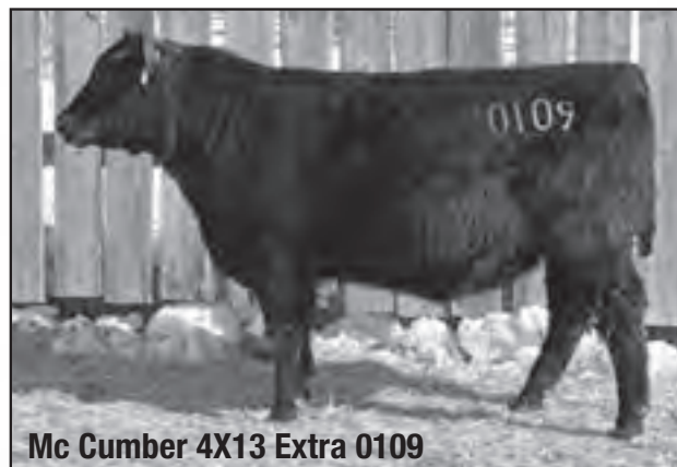
Mc Cumber 4X13 Extra 0109

This masculine, muscular bull is a real eye catcher. He is long bodied, thick topped, and wide rumped. He puts a foot down in all four corners and travels free and easy. His moderate framed dam is easy fleshing, wide based, and fertile.