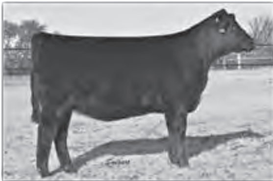
Missing Link X 536P daughter Rosetta 0155 of Mc Cumber

0173 is one of the top IMF bulls in the entire sale. He scanned an IMF of 5.38 to ratio 154. In addition, he is a sound structured, deep bodied son of 536P. His dam is a moderate framed, deep bodied daughter of LT Timberwolf 5014.