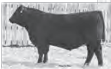
Maternal brother to dam • Mc Cumber 6120 Traveler 8144

and overall type has set the standard here. She has a WWR 5@114, YWR 5@108, and IMF 5@110, and calving interval of 6@366 days. Her sons include last year's high selling bull Mc Cumber 4x13 Extra 975 to Haugen Cattle Company, and two other sons that sold to Joe Bohl in ND. She has averaged nearly $8700 on 3 sons through past Mc Cumber bull sales.