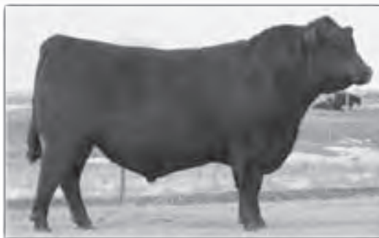
Sire • Sitz Rainmaker 653