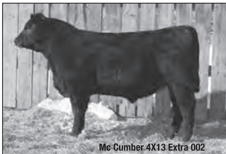
Mc Cumber 4X13 Extra 002

Selling 2/3 interest and full possession- Recommended for use on heifers- This will be the last son of Miss Wix 7111 of Mc Cumber to sell here at Mc Cumber. She is the dam of Mc Cumber 7111 Total Value 209 that sold to Redland Angus and Marcy Cattle Company through our 2003 bull sale. She also produced Miss Wix 2022 of Mc Cumber who was the top selling female of our 2009 Female sale to Sinclair Cattle Co. for $26,000, as well as two other full sisters, one which sold to Fortune's Rafter U Cross Ranch in SD through our 2003 for $15,000 and another that sold to Terry Little in MO through our 2006 Female sale for $12,500 as a weaned heifer calf. 002 has two full sisters retained here at Mc Cumber. Miss Wix 6145 of Mc Cumber is the dam to one of the high selling Missing Link sons in last year's sale to Kemnitz Angus for $8750, and was used back here. 6145 was flushed for the first time last spring. Another full sister is a first calf heifer nursing a super Missing Link heifer calf this year.