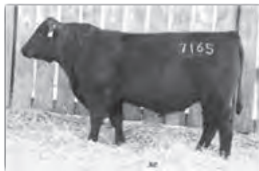
Maternal Brother • Mc Cumber 536P Ext 7165

Selling 2/3 interest and full possession- Recommended for use on heifers- 047 is a long spined, bigger framed, big topped calving ease son of Mc Cumber Hard Drive 7150. This is the second calf crop by 7150 and he really sired a high performing, heavy muscled set of sons. 7150 was one of the high selling lots of our 2008 bull sale to Master Angus in MT, where they have calved out many daughters and report good mothering, excellent udder structure, and the ability to lay down and have calf without messing around. He has a unique combination of muscle, length, soundness and added scrotal circumference with top performance, calving ease, and carcass. 047 gained near the top of his contemporary with an ADG of 3.97 lbs/day to ratio 114, and earned a 365 day weight of 1310 lbs. to ratio 107. He scanned well with an IMF of 3.50 to ratio 100, and had one of the largest REA of 14.4 to ratio 116. His dam is an extremely light birth weight cow with a BWR of 5@83 and has an average birth weight on her calves of 72 lbs. She has also done well on the ultrasound with an IMF 4@109, and REA 4@109. Lassie 4117 is a