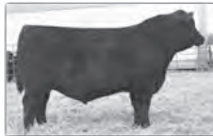
Maternal brother to dam Mc Cumber Timberwolf 7168

0145 is a heavy muscled, deep bodied, wide tracking son of Mc Cumber Hard Drive 7150. He has a masculine, muscular look to him, and travels with ease. He gained 3.88 lbs/day to ratio 112, and earned a 365 day weight of 1286 lbs to ratio 105. His ultrasound is extremely impressive with an IMF of 3.49 to ratio 100, and a REA near the top at 14.1 to ratio 114. His dam is one