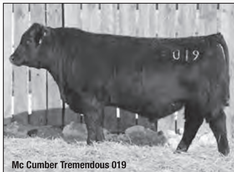
Mc Cumber Tremendous 019