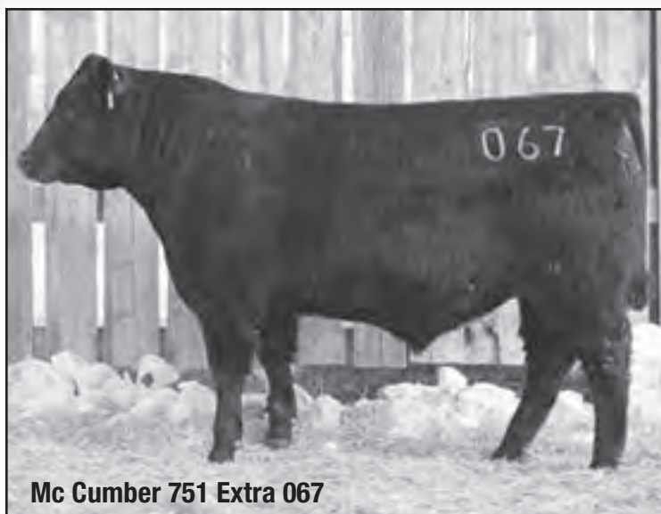
Mc Cumber 751 Extra 067