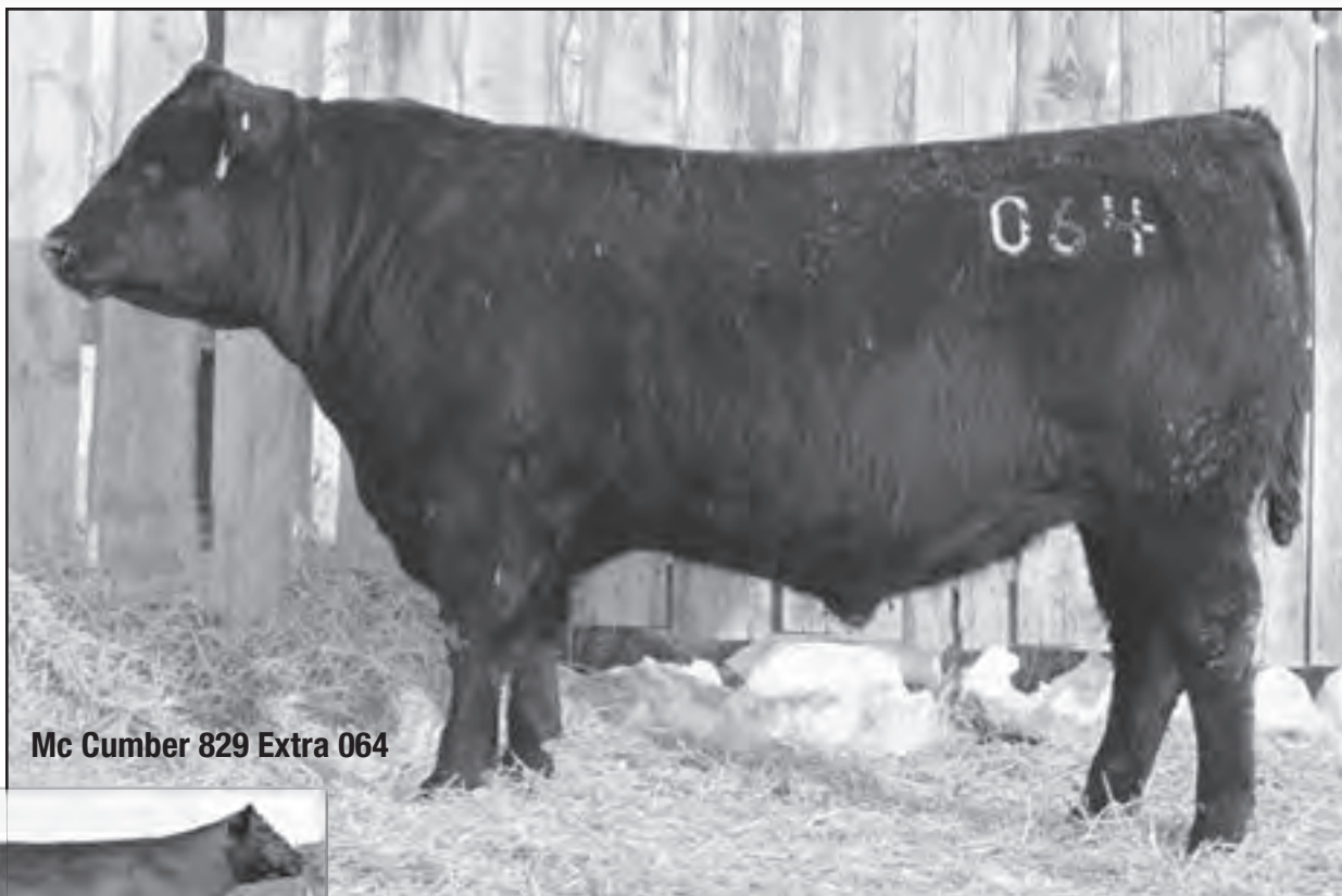
Mc Cumber 829 Extra 064