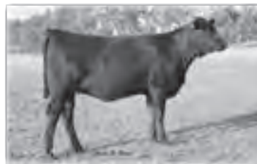
Dam as a heifer calf • Miss Wix 6002 of Mc Cumber

Selling 2/3 interest and full possession- This big bodied, large scrotaled son of Rainmaker 6536 was one of the top gaining bulls on test with an ADG of 4.14 lbs/day. He earned a 365 day weight of 1334 lbs. to ratio 109, and scanned well with an IMF of 3.64 to ratio 104. This gentle dispositioned bull is out of a maternal sister to the Lot 1 bull in this sale and is a very productive daughter of 004 with a WWR 3@102, and