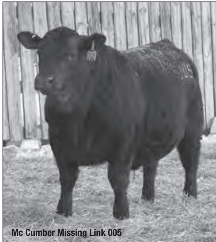
Mc Cumber Missing Link 005