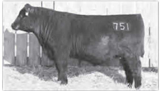
Mc Cumber 4X13 Extra 751