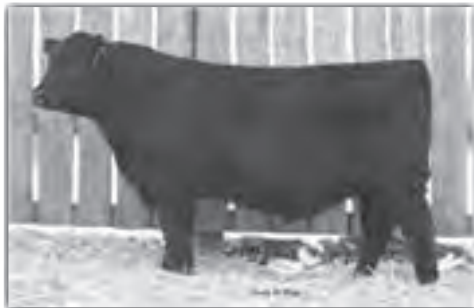
Maternal brother • Mc Cumber 2700 RT Time 845

This big scrotaled, heavy muscled son of Missing Link, is wide based, deep bodied and free moving. He weaned off his dam at 712 lbs and had a REA of 12.6 to ratio 102. His dam is a one of the top 004 daughters on the Ranch, and has already produced one top selling bull to Crider Ranch for $7250. She is a fertile, productive member of the B Pride cow family with a WWR 5@101, YWR 5@101, and a calving interval 6@365. She has never missed settling first service AI and her two daughters in production here have never missed either.