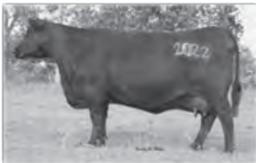
Grand dam to Lot 55 • Miss Wix 2022 of Mc Cumber

Sure 087 was just average on his performance, but the best cow makers, most maternal bulls are not extreme in any way. 087 is bred to ensure light birth, moderate framed, forage efficient cattle that with be long lived, problem free, and help add to the bottom line of cow/calf producers.