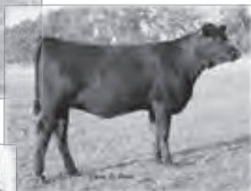
Maternal sister to dam • Miss Wix 6002 of Mc Cumber as Heifer calf