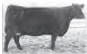
Maternal sister to dam • Lassie 974 of Mc Cumber