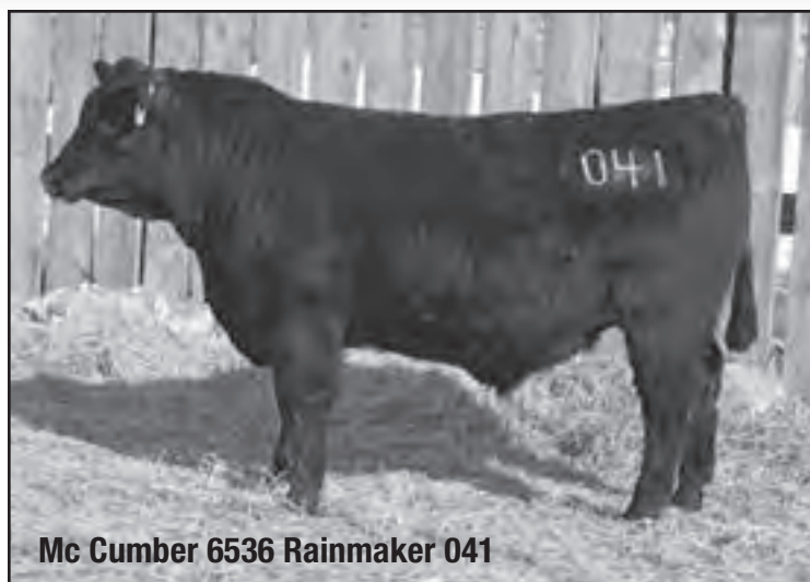
Mc Cumber 6536 Rainmaker 041

Recommended for use on heifers- This sleep all night heifer bull has a 65 lb birth weight and a BW EPD of -1.3. He is a big scrotaled, deep bodied, sound structured son of Missing Link. He gained above average on test, and his dam is a flawless uddered Right Time dam who is nursing one of the lightest birth weight Sinclair Entrepreneur 8R101 sons born so far this spring, with a birth weight of 84 lbs. Put together a bunch of these bred alike bulls sire a consistent calf crop.