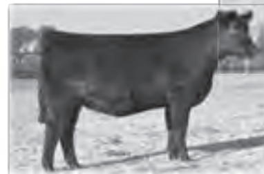
Maternal Brother • Mc Cumber 004 Traveler 6120