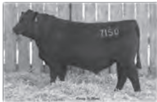
Sire • Mc Cumber Hard Drive 7150