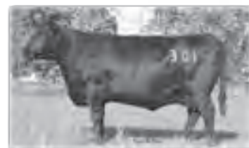
Grand dam • Miss Wix 301 of Mc Cumber,