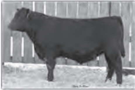
Maternal brother • Mc Cumber 4X13 Extra 8130

Recommended for use on heifers- This long bodied, smooth made son of 6536 performed well across the board. He earned a 205 day weight of 710 lbs without creep to ratio 106, and recorded a 365 day weight of 1262 lbs to ratio 103. 0100 is a bit bigger framed, and produced from a 4th consecutive generation pathfinder daughter of 004. Lassie 6104 is feminine fronted, but also has plenty of capacity, and natural width. In addition, she is neat uddered, good footed, and eye appealing. Her production and fertility has been outstanding with a BWR 3@98, WWR 3@106, YWR 3@102, and an IMF 3@110. She has a calving interval of 4@361, and is nursing a super bull calf by OCC Tremendous 619T already this year.