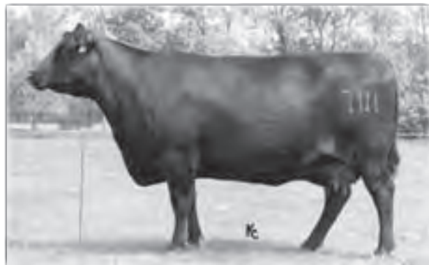
Great Great Grand dam Miss Wix 7111 of Mc Cumber