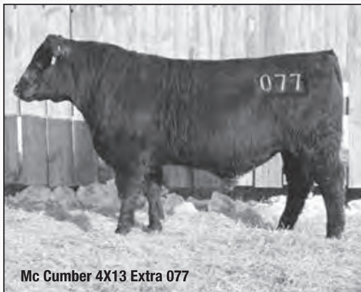
Mc Cumber 4X13 Extra 077