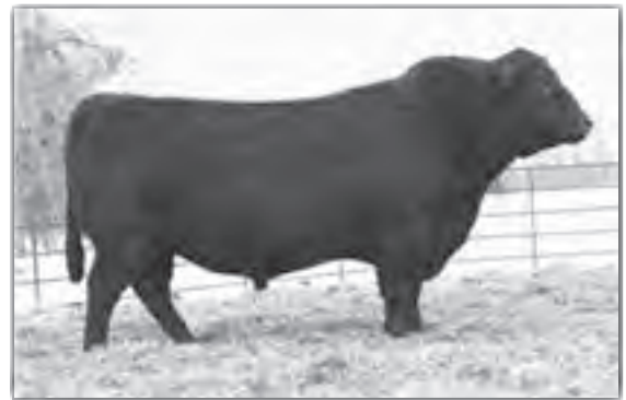
Sire • Sitz JLS Emulation EXT 536P

0159 is the result of a father-daughter mating and resulted in a masculine, moderate, thick made beef bull. His dam is easy fleshing, near perfect uddered, and sound footed. This cow maker should sire some stout, moderate, low maintenance females that can thrive under harsh conditions.