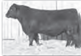
Maternal brother • Mc Cumber 4X13 Extra 975