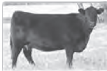
Paternal Sister to Dam • Miss Wix 2027 of Mc Cumber

Selling 2/3 interest and full possession- Recommended for use on heifers- If your looking for one that excelled at every measure here he is. 039 weaned off his dam with a 205 day weight of 730 lbs to ratio 109, gained nearly 4.00 lbs/day to ratio 113, and earned a 365 day weight of 1359 lbs. to ratio 111. Along with this he had an IMF of 3.93 to ratio 112, and a REA of 12.9 to ratio 104 with a BF of only .27. In addition to his outstanding performance, and ultrasound, 039 is a deep bodied, heavy muscled bull with a big scrotal and the look of a beef bull. His dam is a highly productive daughter of Garrison Dynamite 8128,