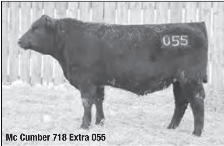
Mc Cumber 718 Extra 055

034 is a heavy muscled, high libido son of OCC Tremendous 619T who has been acting like a mature bull all winter. He weaned off his dam at 750lbs, scanned a REA of 13.3 to ratio 106, and earned a 365 day weight of 1241 lbs to ratio 102. His 6th consecutive generation pathfinder dam is not only fertile, but productive as well. She is a member of the Gale cow family and a daughter of one of the most productive females to reside on this Ranch.