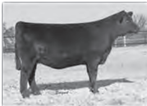
Lassie 010 of Mc Cumber