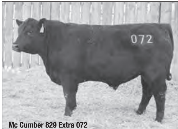
Mc Cumber 829 Extra 072