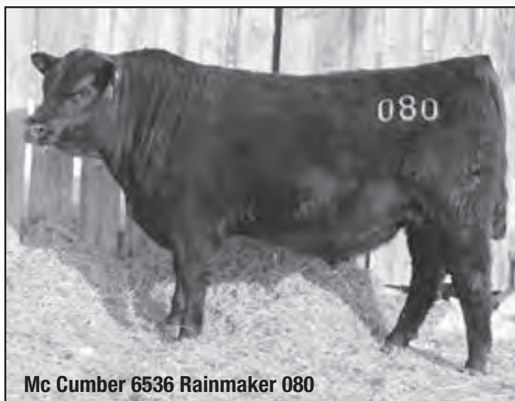
Mc Cumber 6536 Rainmaker 080

This true calving ease herd bull prospect is linebred for predictable females. These females will have the ability to hustle for forage and maintain themselves in an array of environments.