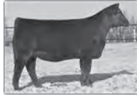
Sitz JLS Emulation EXT 536P daughter that sold to Saddle River Miss Wix of Mc Cumber 0190

Recommended for use on heifers- This light birth, docile son of Rainmaker 6536 is moderate framed, deep bodied, and naturally thick. 0119 is sound structured, wide based, and heavy muscled. He has one of the best IMF scores with an IMF of 4.48 to ratio 128. His dam is a fertile, easy fleshing, good uddered daughter of 536p. B Pride 7186 of Mc Cumber has calved earlier every year and has earned a calving interval of