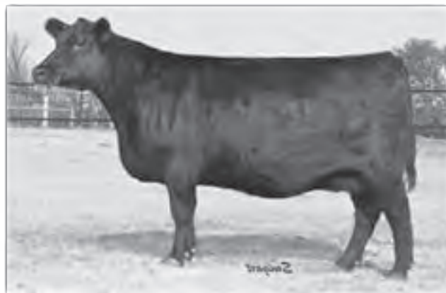
Grand dam • Miss Wix 409 of Mc Cumber