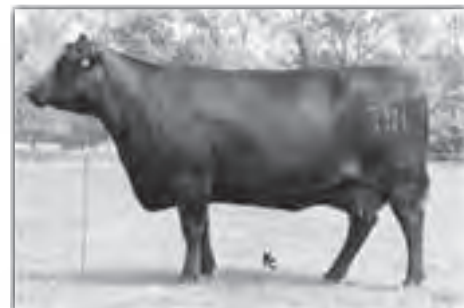
Dam • Miss Wix 7111 of Mc Cumber