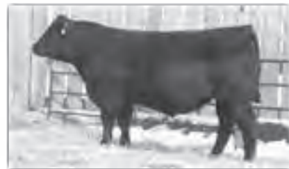
Sire • Mc Cumber 4X13 Extra 829

dam at 768 lbs. and earned a WWR of 106. His double bred Miss Wix 365 bred dam has produced 2 sons that sold to Mongeon Bros and Vegas Varty in ND. This good looking, long bodied, deep bodied bull is bred for consistency, and should help add to your bottom line.