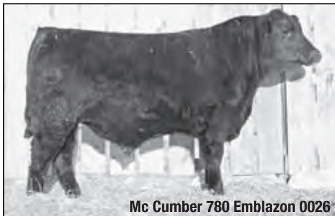
Mc Cumber 780 Emblazon 0026

Recommended for use on heifers- This big, stout Rainmaker performed near the top on test. He gained 3.81 lbs/day to ratio 108 and earned a 365 day weight of 1266 lbs to ratio 103. His easy fleshing, neat uddered dam is a member of the Rosetta cow family and is a maternal sister to Mc Cumber 6122 Equator 419, who was used AI here at Mc Cumber, and Mc Cumber 4X13 Extra 8013 who was the featured Lot 3 bull in our 2009 bull sale to the Schaak Ranch in SD. Her light birth, productive dam was a donor for us, and one of the top Mc Cumber Foundation 701 daughters on the Ranch.