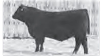
Mc Cumber 6120 Traveler 8144

Selling 2/3 interest and full possession- When it comes to siring productive, fertile, easy fleshing, good uddered females it might not get much better than 0180 in this department. This late February 536P son weaned off his pathfinder dam with a 205 day weight of 706 lbs. to ratio 106 and had an IMF of 3.76 to ratio 107. 0180 is a high libido bull with length, soundness and plenty of muscle. His pathfinder dam is one of the all time top cows here at Mc Cumber. She is a big bodied, naturally thick daughter of Pine Creek Right Time 1147. 463 is a fertile, easy fleshing, good footed, neat uddered cow that doesn't miss. She is the dam to last year's sale topper at $10,500 to Haugen Cattle Company, and has produced a total of 3 sons that have sold for an average of nearly $8700. Her other two sons have both sold to long time customer Joe Bohl in ND, and her only daughter is the dam to the herd sire prospect selling as Lot 2 in this sale. She has been one of the highest rationing cows in the herd with a WWR 5@114, YWR 5@108, IMF 5@110, and calving interval of 6@366. B Pride 463 will enter the donor pen this spring in order to add more daughters to our herd.