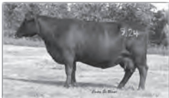
Dam • B Pride 9124 of Mc Cumber

These two flush brothers would make a nice pair to turn out for a more consistent calf crop.