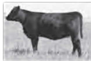
Full sister as a calf • B Pride 613 of Mc Cumber

086 should be a predictable sire of sound, fertile, problem free females, and males with added depth, thickness and performance.