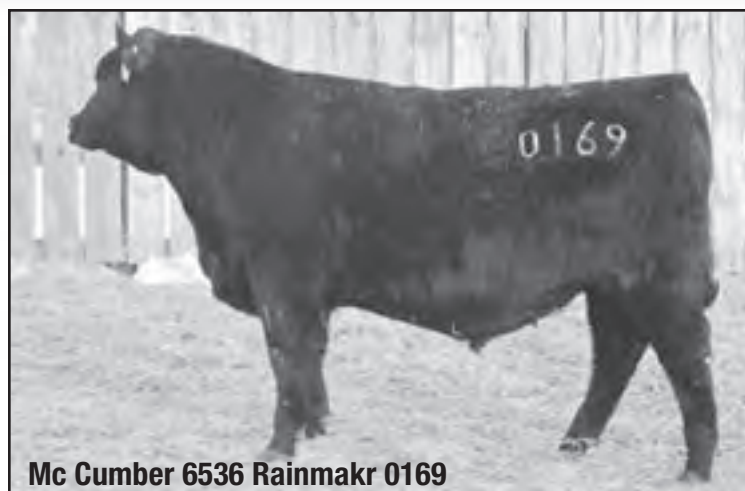
Mc Cumber 6536 Rainmakr 0169