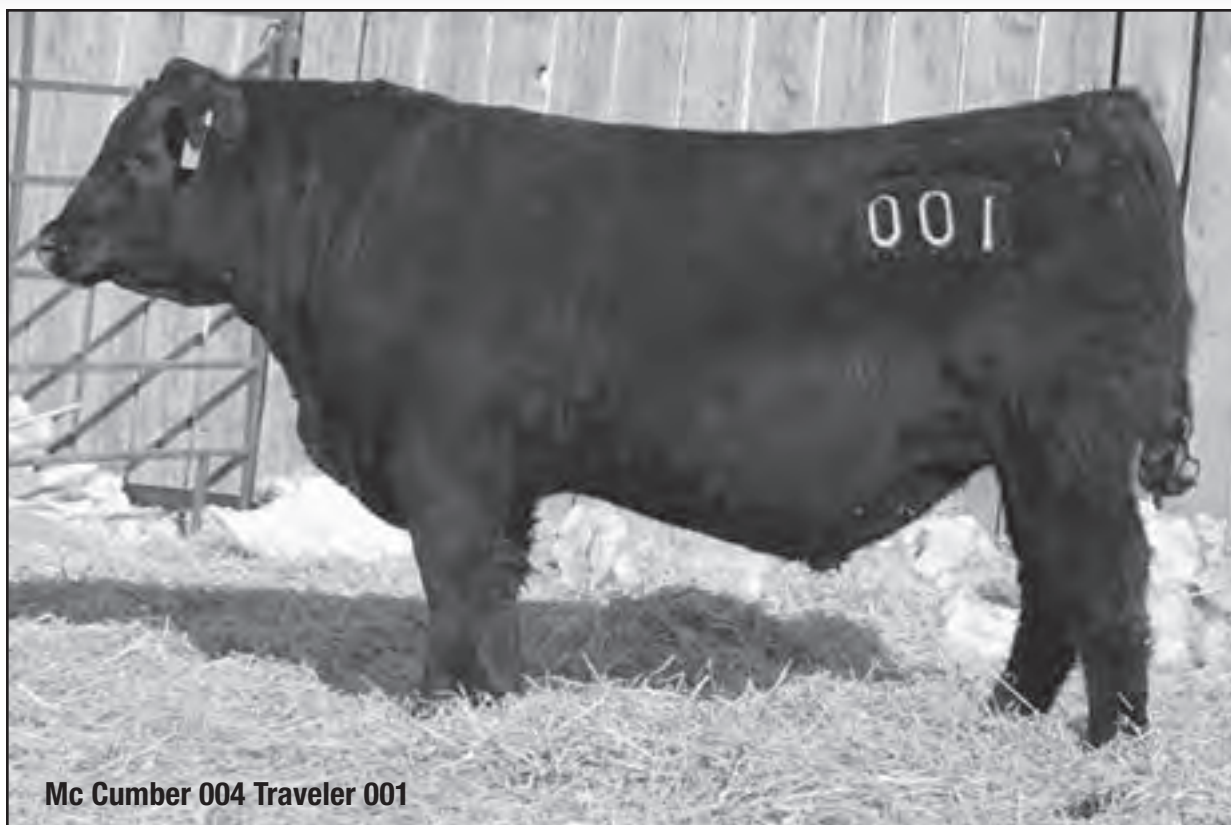
Mc Cumber 004 Traveler 001