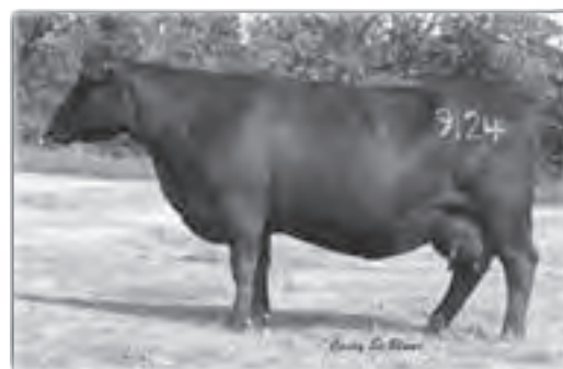
Dam • B Pride 9124 of Mc Cumber