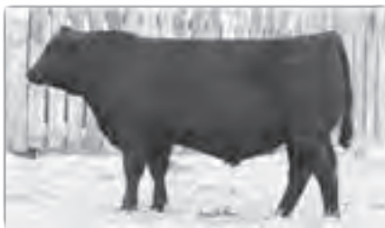
Maternal brother • Mc Cumber 6120 Traveler 9138

Not only is 0110 a sure bet on heifers, but should be a sire of fertile, moderate framed, easy fleshing females.