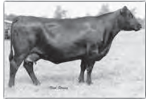
Grand dam • Gale 045 of Mc Cumber

055 is a deep bodied, thick made beef bull, with plenty of performance. His dam is a beautiful daughter of Mc Cumber 7078 VRD 3108. She is deep, thick, easy fleshing, and nice uddered. B Pride 6163 has never missed settling AI, and maintains her flesh as well as any on the Ranch.