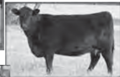
Miss Wix 2027, granddam of Lot 1.