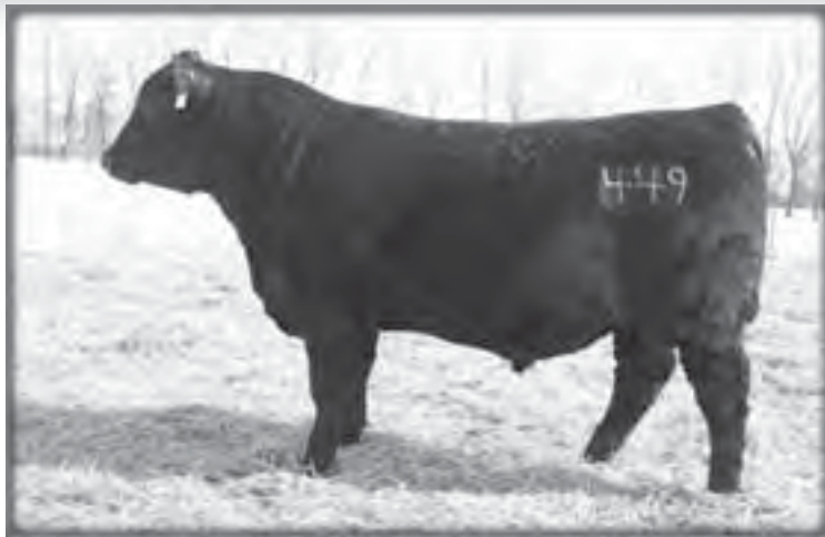
Maternal brother to Lot 82.