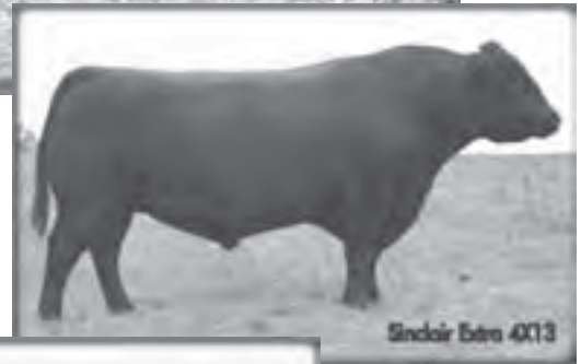
Sire of Lot 21.