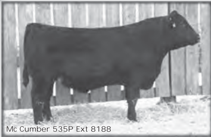
Mc Cumber 535P Ext 8188