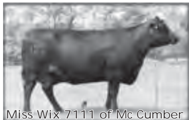
Miss Wix 7111 of Mc Cumber

Selling 2/3 interest and full possession- Recommended for use on heifers- 8113 should be a sure bet calving ease bull by LT Timberwolf, and out of an outstanding daughter of Sinclair Extra 4x13. 8113 is a thick made, deep bodied bull. He is smooth fronted, extra sound, and has a thick, meaty rump. He started at only 72 lbs. and earned one the top IMF scores of the group at 5.05 to ratio 136. His dam is a beautiful daughter of 4x13 that is moderate framed, deep bodied, and has a near perfect udder. She rebred quickly and is currently nursing a herd bull prospect by OCC Missing Link. She is a maternal sister to Miss Wix 2022 of Mc Cumber who is the outstanding donor dam of many outstanding progeny that have sold through previous sales, and her dam Miss Wix 7111 is the female that has carried on for Miss Wix 365 of Mc Cumber. The full brother to Miss Wix 6145 is being retained here for use on heifers. 8113 is backed by a cow family that is second to none, and combines this with calving ease, Marbling, and an appealing phenotype.