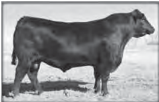
Sire of Lot 3.

with 3/92 BWR, 3/106 WWR, and 3/101 YWR. You'll put on a Lot of miles to find a calving ease bull with this much performance.