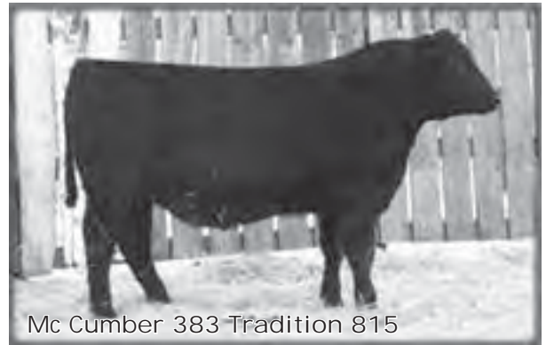
Mc Cumber 383 Tradition 815

Long, smooth, and free moving best describe this son of Mc Cumber Tradition 383. His pathfinder dam is a moderate framed, easy fleshing, good footed daughter of Mc Cumber Mr. Wix 7104. She has been very productive with a WWR 5/107, and YWR 5/103.