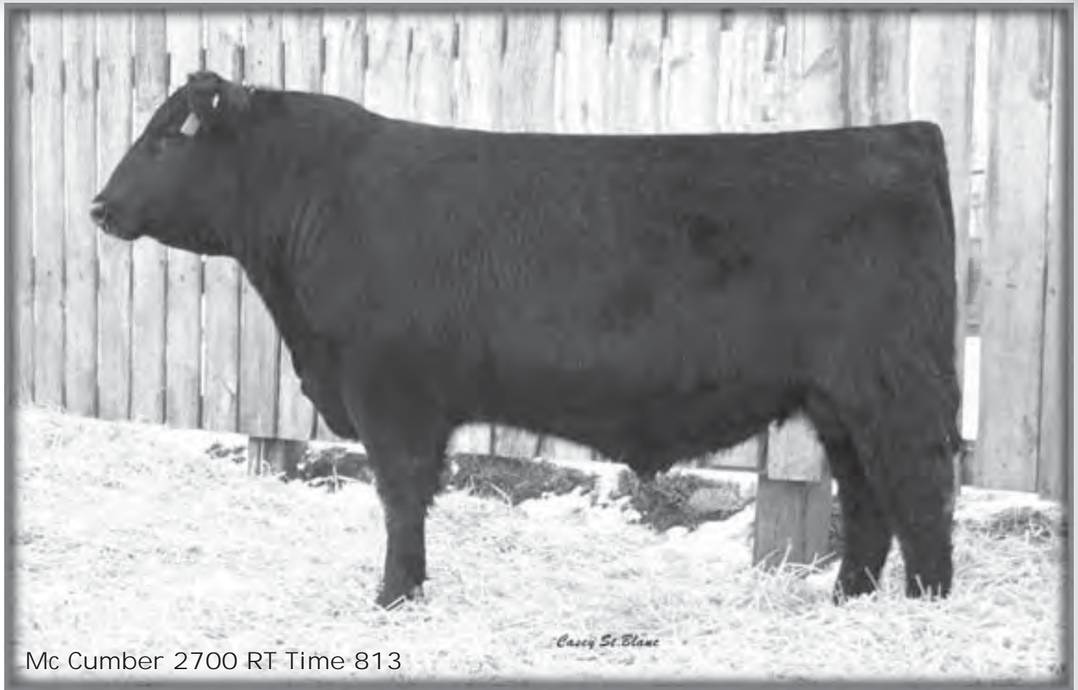
Mc Cumber 2700 RT Time 813