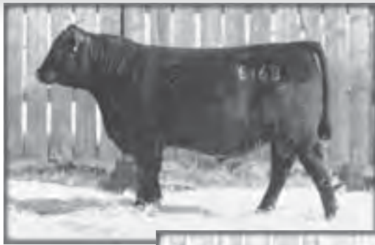
Maternal brothers of Lot 22.