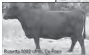
Maternal grand dam of Lot 22.