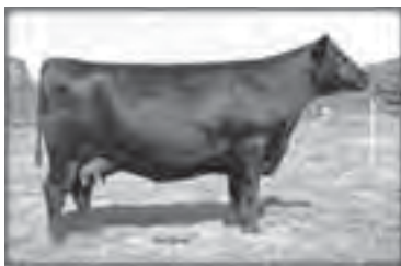
Maternal grand dam of Lot 79.