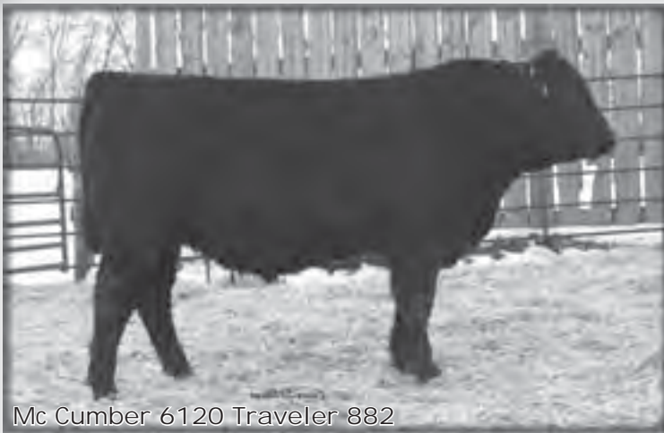
Mc Cumber 6120 Traveler 882