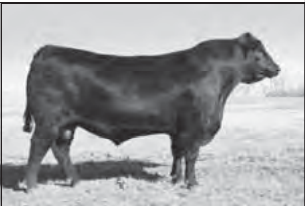
LT Timberwolf 5014 reg no 15147477 Outstanding sire of performance and muscle. His sons are powerful.

Sample of the bulls selling on March 30, 2009