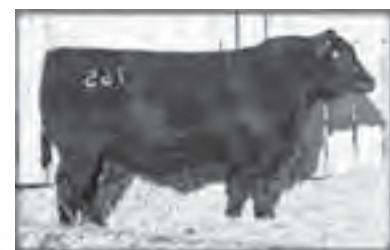
Maternal brother to Lot 103.

Recommended for use on heifers- 8034 is a result of the mating that has worked so well for us. He is a 4x13 out of a 004 daughter that is moderate framed, sound structured, and excellent uddered. He earned a 365 day weight of nearly 1100 lbs. and scanned an IMF of 3.92 to ratio 107.