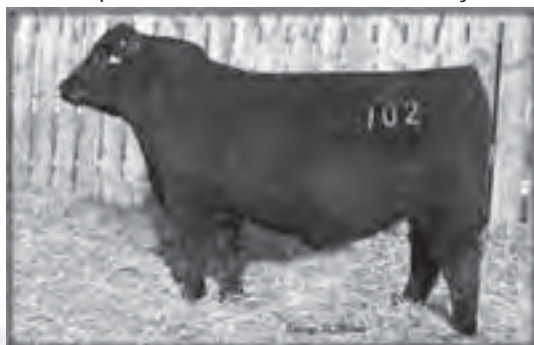
702 is a full brother to Lot 86.