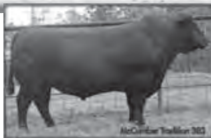
Mc Cumber Tradition 383, sire of Lot 2.