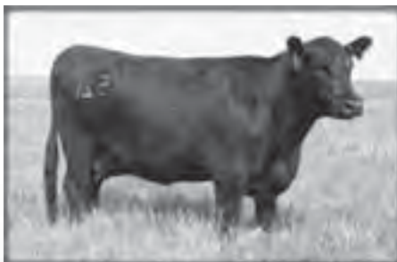
Lassie 521 of Mc Cumber, dam of Lot 7.