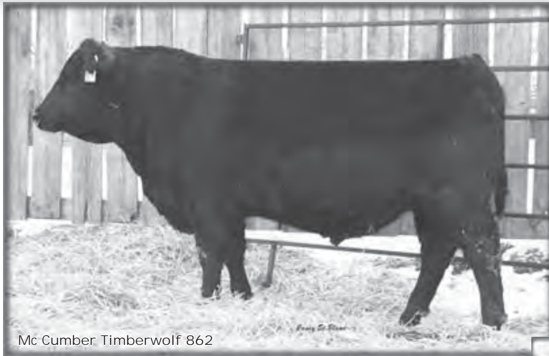
Mc Cumber Timberwolf 862