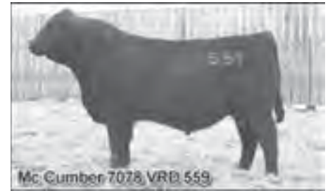
Maternal brothers to Lot 73.