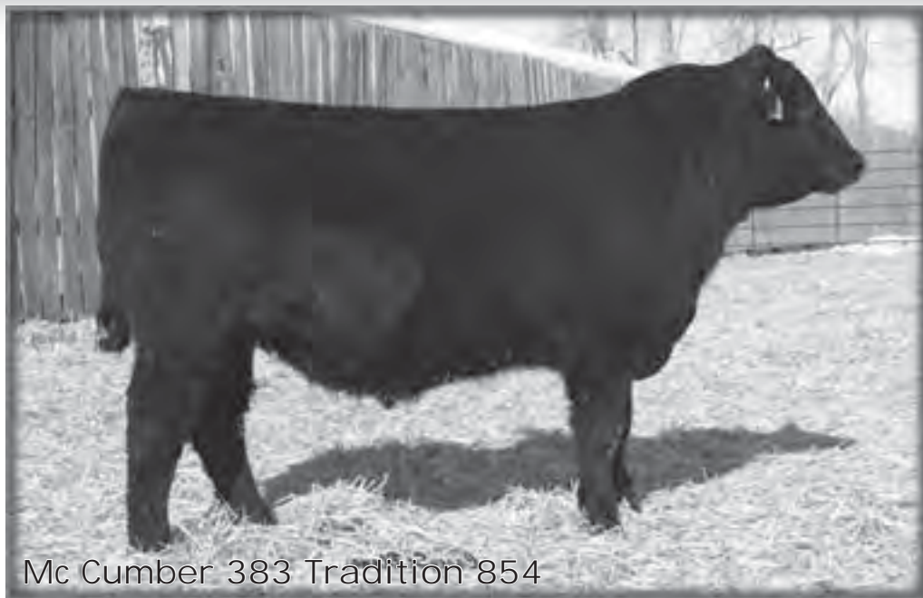
Mc Cumber 383 Tradition 854