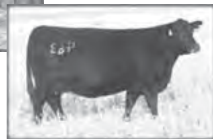
Dam of Lot 5.