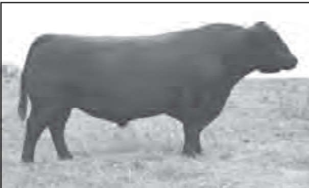
Sinclair Extra 4X13 reg no. 14774030 The most consistent sire of both bulls and females we have used.

Annual Bull Sale : March 30, 2009 at the ranch 1:30 CST Selling 110 yearling Angus Bulls