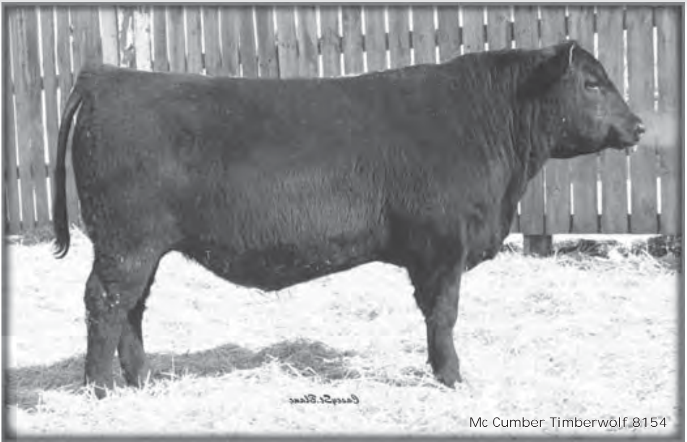
Mc Cumber Timberwolf 8154