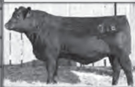
Maternal brother of Lot 6.