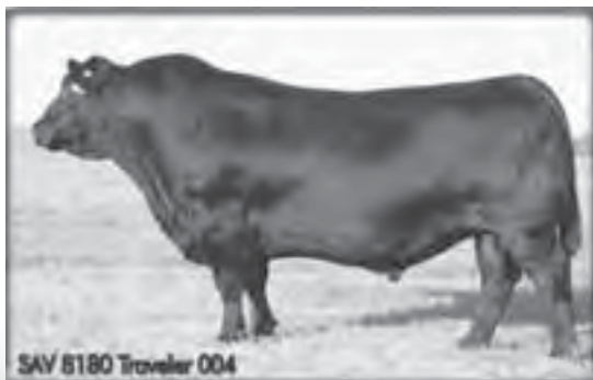
Maternal grand sire of Lot 20.

Selling 2/3 interest and full possession- The mating of Right Time on the 004 daughters has really worked and this bull is no exception. 845 is long, thick, deep, and combines this with top-notch stats across the board. He has an easy stride, and is one that catches your eye when you enter the pen. He earned a 205 day weight of 712 lbs. to ratio 102 and was one of the top gaining bulls in the pen with a gain ratio of 118. He weighed off test at 1250 lbs. and had a 365 day weight of nearly 1300 lbs. to 108. His dam is an outstanding daughter of 004. She is moderate framed, easy fleshing, and has an outstanding udder with small well placed teats, and excellent rear and fore udder attachment. She has never missed first service AI and is currently nursing an excellent 4x13 heifer calf. B Pride 461 is a full sister in blood to the dam of Lot 11. 845 is not only backed by an outstanding cow family, but he has the performance, body type, and easy going disposition to be a positive addition to anyones herd.