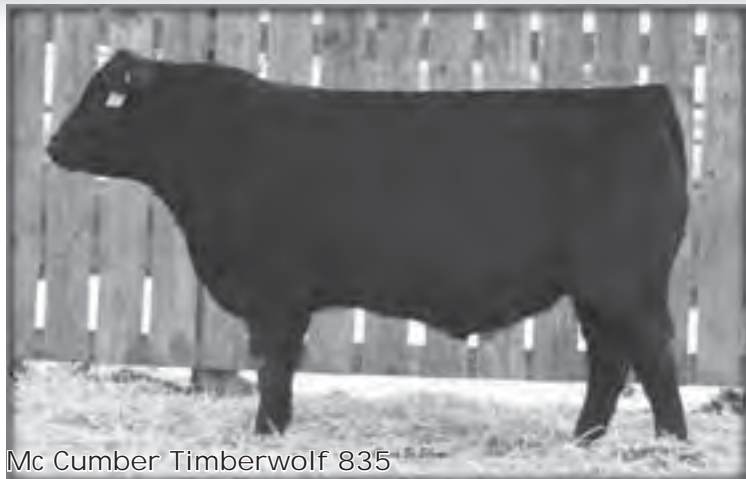
Mc Cumber Timberwolf 835