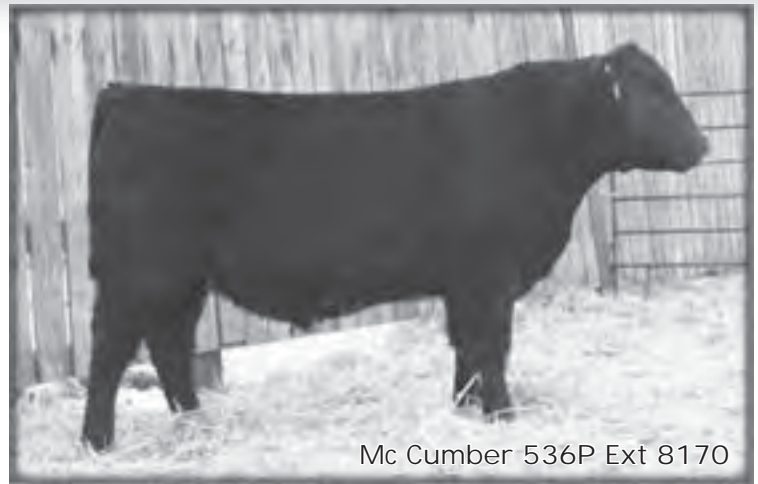
Mc Cumber 536P Ext 8170