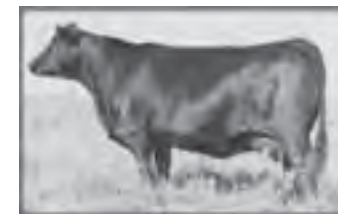
Miss Wix 098, great grand dam of Lot 1.