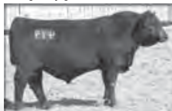
Maternal Brother 419

We think 8013 is one of the top 4x13 sons produced to date. He should produce the type of females that a breeder can build a herd around, without sacrificing early growth, and carcass traits.