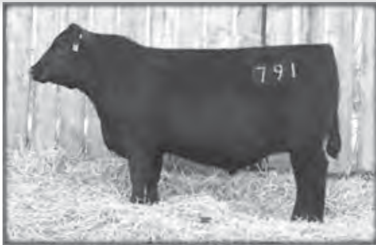
Maternal brother to dam of Lot 68.