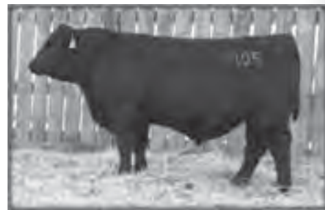
Maternal brother to Lot 76.

Selling 2/3 interest and full possession- Recommended for use on heifers- One of the youngest bulls in this sale, but certainly possesses qualities not to be overlooked. 8210 is a heavy muscled, moderate framed, deep bodied son of 4x13 with extra shape to top and rear quarter. He scanned superbly with an IMF of 3.91 to ratio 105 and had a REA of 12.2 to ratio 104. His dam is an easy fleshing, super uddered grand daughter of Right Time that exhibits the body type that should shine in a low input, forage based management system. She has produced two sons that have sold to Gurr Lake Angus Ranch, and her 2007 born son sold in last year's sale to Isaak Angus Ranch for $9500.