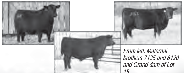
From left: Maternal brothers 7125 and 6120 and Grand dam of Lot 15.

Selling 2/3 interest and full possession- A March born herd bull prospect by 4X13 and a maternal brother to the $7250 selection of Brad Gilbertson through last year's sale. A little higher BW puts him just outside of the parameters to be a heifer bull, but this long bodied, smooth fronted son of 4x13 has plenty of performance to be used on mature cows. He earned a 205 day weight of 758 lbs. to ratio 108, and recorded a 365 day weight of 1252 lbs. to ratio 105 at a year. 8202 is one of the top scanning bulls in the group with an IMF score of 4.71 to ratio 127, and a REA of 12.4 to ratio 106. 8202 puts a foot down in all four corners, is big topped and has plenty of shape to hind end. His dam is a top producing daughter of BT Right Time 24J, and a maternal sister to Mc Cumber 004 Traveler 6120. Erianna 5105 is a moderate framed, sound uddered, good milking female who has yet to miss. She has produced two calves with a WWR of 2/110, YWR 2/106, IMF 2/134, and REA 2/100. His grand dam is the outstanding donor Erianna 2206 of Mc Cumber who has ratios of WW 5/109, YW 4/113. She has been extremely fertile, and continues to be one of our top donors. 8202 is one of the youngest bulls in the sale, but has the maternal heritage, performance, and phenotype to be a top herd bull prospect.