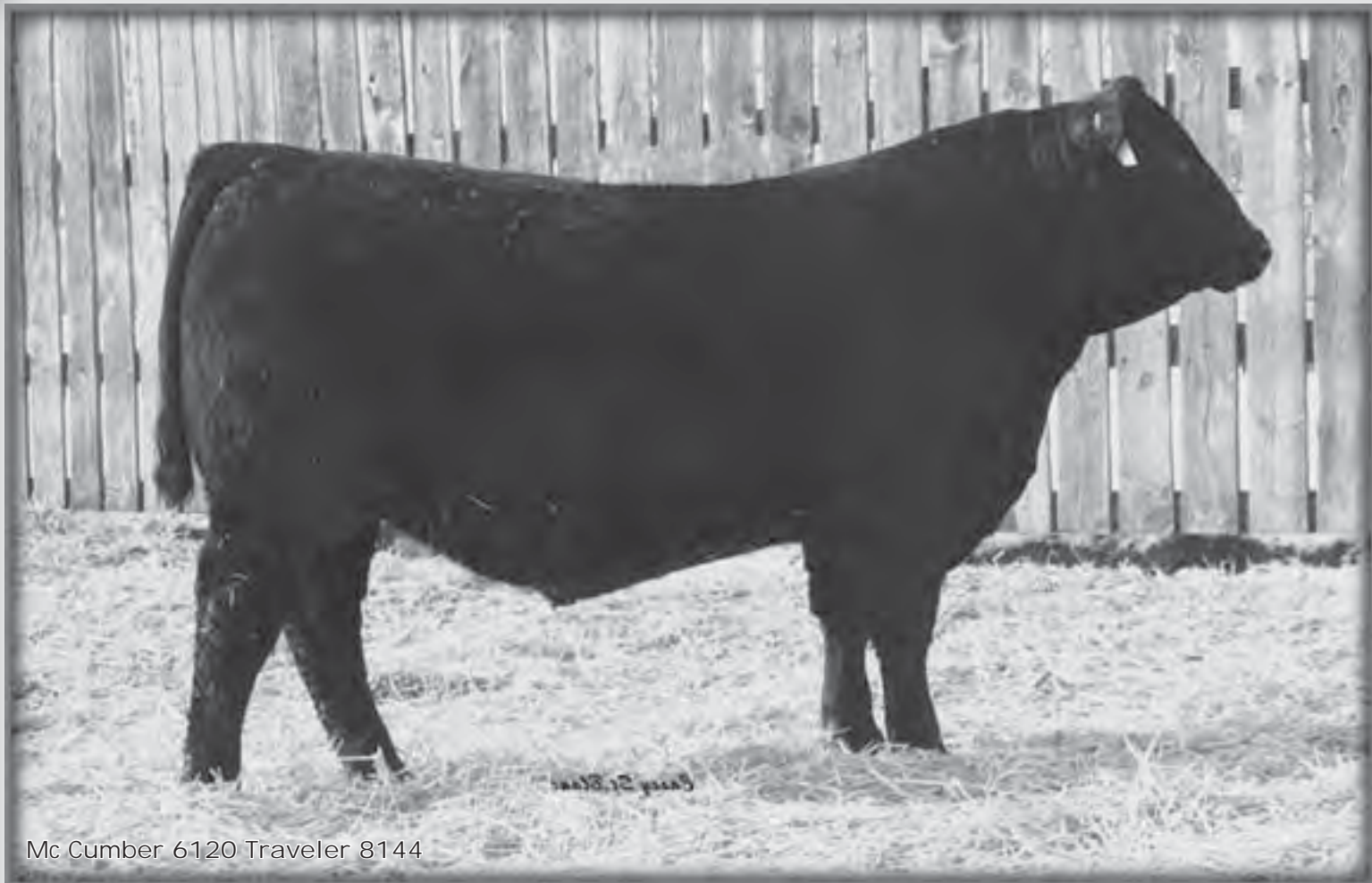
Mc Cumber 6120 Traveler 8144