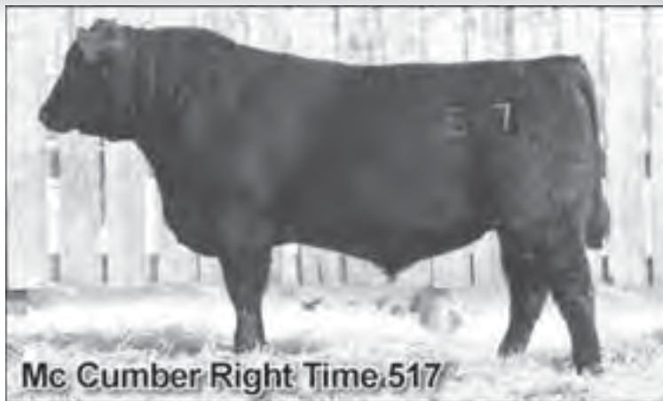
Mc Cumber Right Time 517