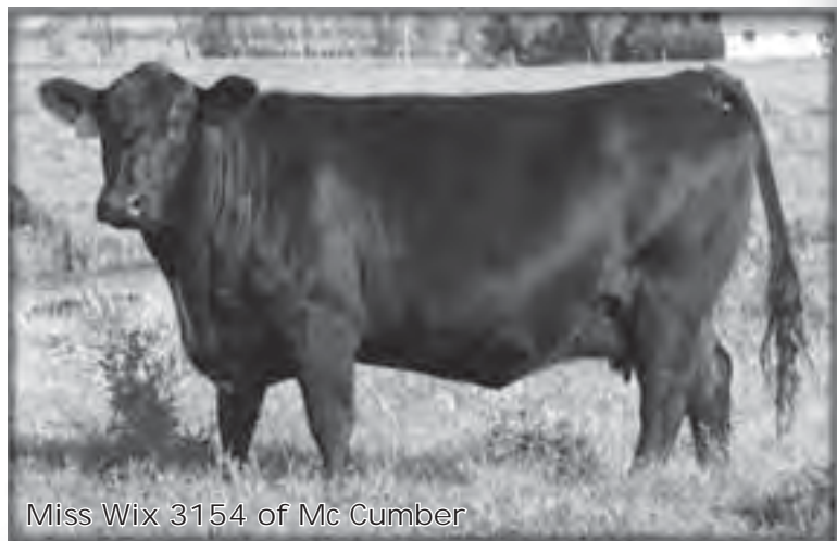
Miss Wix 3154 of Mc Cumber