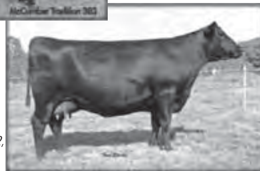
Oak Hill Miss Wix 9402, dam of Lot 2.

Selling ½ interest and full possession- 8134 is a legitimate beef bull. He has as much natural thickness, and depth of body as any bull in this sale. He puts a leg down in all four corners and has a masculine eye appealing look to him. He is one of the best sons of Mc Cumber Tradition 383 that we have produced. He was a favorite of visitors to the ranch this past summer and weaned off his outstanding dam at 808 lbs. without creep. He is the natural calf of Miss Wix 9402 who we purchased half interest in after seeing on the National Angus Tour. Miss Wix 9402 is an outstanding daughter of EXT who is deep bodied, easy fleshing, good footed, and has the type of udder you would expect from an EXT daughter. She traces directly to Miss Wix 365 of Mc Cumber and has