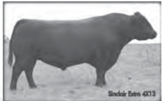
Sire of Lot 27.

Selling 2/3 interest and full possession- Recommended for use on heifers- I don't know if his picture does him justice, but this is one of the very best sons of 4x13 in this sale. 8037 is extremely long bodied, wide based, and heavy muscled. He is super on his feet and legs and moves out with ease as he travels. This sure shot calving ease herd bull prospect has been a standout since birth. He started with only a 70 lb. birth weight and weaned off at 724 lbs. on September 7th without any creep. He combines an extremely low BW EPD of -1.1 with a WW EPD of +48, and YW EPD of +80. To go along with this he scanned exceptionally well for both IMF and REA area with an IMF score of 4.35 to ratio 119, and a REA of 13.1 to ratio 117. His dam is a moderate framed, easy fleshing, perfect uddered daughter of 004, and bred back quickly while raising this calf. 8037 puts it all together, calving ease, outstanding performance, tremendous carcass and a dam that is off to a super start. His outstanding stats combined with the ability to sire females that will work in the real world make him a definite sale highlight.