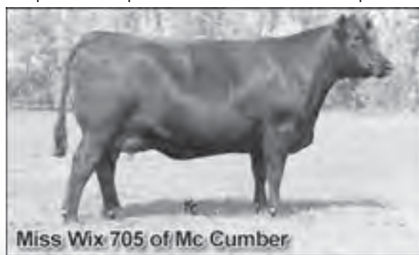
Miss Wix 705 of Mc Cumber

Selling 2/3 interest and full possession- 8170 is as thick as you can make em! He is a wide based bull with a big top, and shapely rear quarter. Along with this, he is sound on his feet and legs, and moves free and easy as he travels. 8170 broke the 800 lb. barrier at weaning with an actual weaning weight of 810 lbs. and a 205 day weight of 764 lbs. to ratio 109. He excelled on ultrasound as well with an IMF score of 4.03 to ratio 108 with only .23 of Back Fat. 8170's visual muscle was confirmed by his REA of 12.5 to ratio 107. His dam is a moderate framed, good uddered daughter of BT New Trend 172K, and a member of the Miss Wix cow family. Her only other son sold to Lynn Hoffert, and two of her daughters have sold for an average of $2000. 8170 is a solid representation of what 536P is siring. They are moderate framed cattle, with an abundance of rib, tremendous thickness, and muscle. The first daughters in production are beyond our expectations. They are moderate, easy fleshing, perfect uddered, and possess the qualities of females that should be productive for many years.