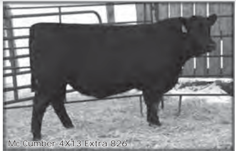
Mc Cumber 4X13 Extra 826