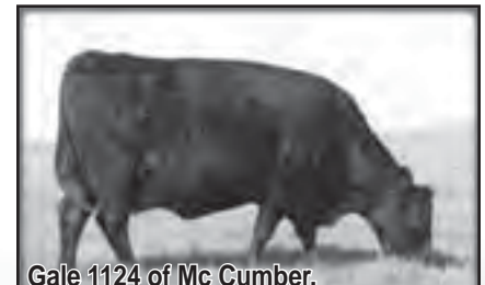
Gale 1124 of Mc Cumber. Dam of Lot 45.