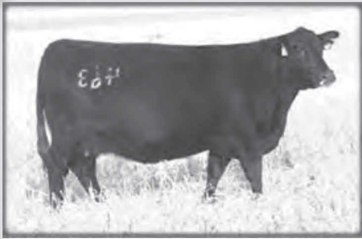
Grand dam of Lot 18.