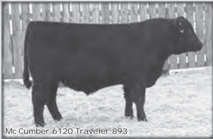
Mc Cumber 6120 Traveler 893