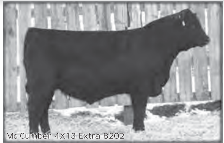
Mc Cumber 4X13 Extra 8202