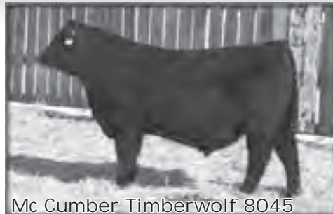
Mc Cumber Timberwolf 8045

Above: Grand dam of Lot 55/ Right: Great grand dam of Lot 55.