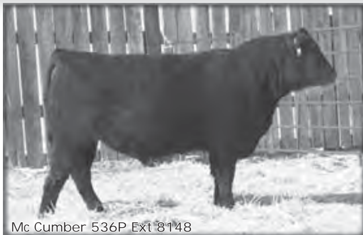
Mc Cumber 536P Ext 8148

Selling 2/3 interest and full possession- Recommended for use on heifers- Extreme calving ease, moderate framed and stylish best describe 834. Along with this he puts a foot down in all four corners, and carries added thickness down his top and out into an expressive rear quarter. He started with only a 61 lb. birth weight, but still managed to earn a 205 day weight over 650 lbs. Additionally, he earned an IMF of 4.85 to ratio 130 and had a REA of 11.8 to ratio 101. His extreme calving ease is confirmed by EPDs with a calving ease direct of +15 and a BW EPD of -3.7 which both rank in the best 1% of non-parent bulls in the breed for calving ease and birth weight. To go along with this he has near average WW and YW EPDS, and is more than adequate on both marbling and REA. His dam is a moderate framed, easy fleshing, naturally thick daughter of Sitz Triangle S Valubull, and a member of the Miss Wix cow family. Breed leading calving ease, excellent new born calf vigor combined with adequate performance, and excellent carcass quality make 834 a bull to check out.