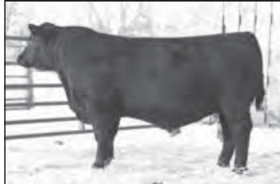
Mc Cumber 004 Traveler 6120 reg no. 15428743 Sires depth, performance and muscle. First sons sell on March 30.

Sale will be broadcast by Superior Livestock Pro- ductions on RFD-TV.