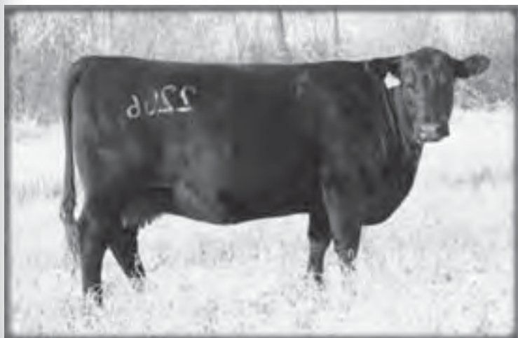
Paternal Grand dam to Lot 24.

This heavy muscled, stout made stock bull is sure to make a Lot of friends come sale day. 8104 excelled at weaning, gain, yearling, and REA with ratios of at least 105. He weaned off his dam at 804 lbs. with a 205 day weight of 765 lbs. to ratio 109. He earned a gain ratio of 108 and had a 365 day weight of nearly 1300 lbs. to ratio 109. His dam is a deep bodied, easy fleshing daughter of BT Right Time 24J, and is a member of the Miss Wix cow family. 8104 will be easy to find sale day and is the type of bull that can add pay weight to a set of calves.