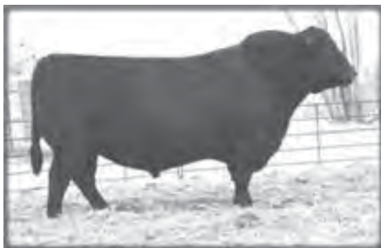
Sire of Lot 92.

The combination of EXT, 6807, and Alliance which has worked so well across the country, has come to fruition again in this top-notch son of 536P. 8205 is a calf I have liked since birth. He is thick, square, and deep. Along with this, he stands wide and true on his feet and legs. This March born bull earned a 205 day weight of 721 lbs. to ratio 103, and recorded an IMF of 4.69 to ratio 126. His Alliance bred dam is moderate framed, deep bodied, and has a neat, well proportioned udder. Her only daughter was retained as a replacement and is doing an excellent job with her first calf.