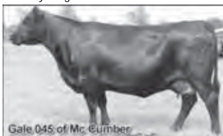
Gale 045 of Mc Cumber Grand dam of Lot 74.

Recommended for use on heifers- 827 is a unique pedigreed calving ease prospect. He weaned off with a 205 day weight of 711 lbs. to ratio 102 as his dam's first calf. His a moderate framed, deep bodied, thick butted son of Valubull, and descends from one of the top females that has ever been on this Ranch. After his dam he traces to 5 consecutive generations of pathfinders that excelled for fertility, productivity, and longevity.