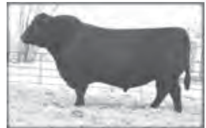
Sire of Lot 84.

Selling 2/3 interest and full possession- 8223 is the youngest bull in the sale, but does not give anything up to his older contemporaries. Long bodied, heavy muscled, deep bodied, and good looking are all terms that could be used to describe this bull. He was one of the top gaining bulls on test with a gain ratio of 119, and earned a 365 day weight of 1253 lbs. to ratio 105. To go along with this, he is the #2 bull for IMF with a score of 5.66 to ratio 152, and scanned a REA of 12.1 to ratio 103. His dam has been top-notch to this point with a WWR of 4/102, YWR 4/106, IMF 4/119, and REA 4/102. She has produced one son that sold to Bar V Ranch in 2007, and both of her daughters have been retained as replacements. Make sure to find this good young bull, he has the bred in ability to sire forage efficient, quick performing offspring with exceptional carcass and conversion traits.