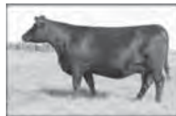
Dam of Lot 6, Miss Wix 409