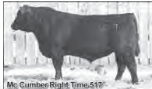
Maternal brother to Lot 95.