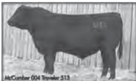
Mc Cumber 004 Traveler 513