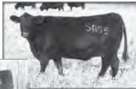
Dam of Lot 60. Left: Full brother to dam.