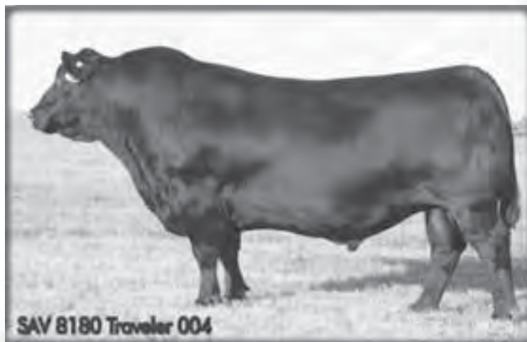
SAV 8180 Traveler 004