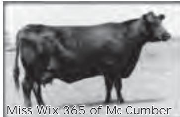
Miss Wix 365 of Mc Cumber