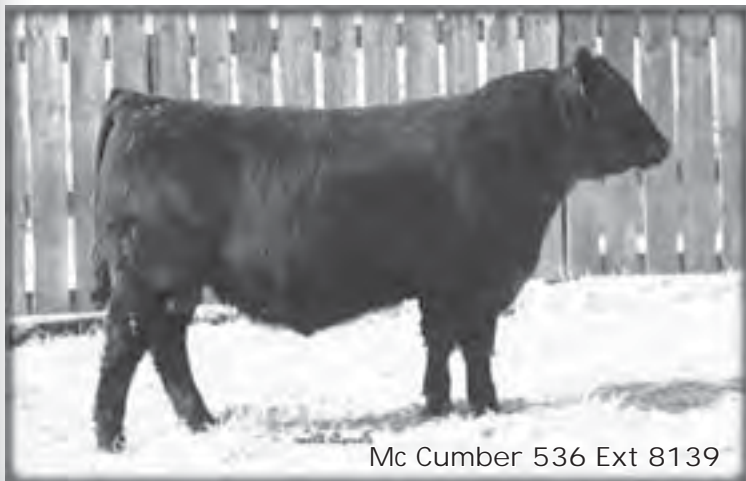
Mc Cumber 536 Ext 8139

This big, stout, high performing son of Timberwolf should add length, and pounds to a set of calves. 864 weaned off his outstanding dam at 838 lbs. and earned a 205 day weight of 743 lbs. to ratio 106. He is the top gaining bull on test will an ADG of 3.89 for a ratio of 127, and recorded a 365 day weight of 1365 lbs. to ratio 115. He scanned an IMF of 3.98 to ratio 107 and had a REA of 12.9 to ratio 110. His dam is a very impressive cow with a ton of rib, and capacity. She is thick from front to rear and has an impeccable udder. Along with this she has been very productive with a WWR of 4/105, YWR 4/107, REA of 4/104.