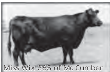
Miss Wix 365 of Mc Cumber

Above: Grand dam of Lot 55/ Right: Great grand dam of Lot 55.