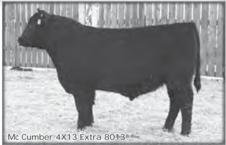
Mc Cumber 4X13 Extra 8013