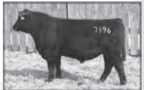
Maternal brother to Lot 10.

Selling 2/3 interest and full possession- 8194 displays outstanding phenotype from every angle. He is thick from end to end, is big topped, and has a thick expressive rump. This March born herd bull prospect has performed well at every level with a 205 day weight of 728 to ratio 104, and a 365 day weight of 1218 to ratio 102. He is one of the top scanning bulls of the group with an IMF of 4.89 to ratio 131, and a REA of 12.8 to ratio 109. His dam is a mother of herd bulls. Her first two sons have sold through previous bulls sales for an average of $7000. Her first son sold to Currant Creek Angus Ranch through our 2007 bull sale, and the full brother to 8194 sold last year to Chapman Cattle Co. in Canada. Lassie 434 has been an outstanding producer and has produced sons with additional REA, and excellent IMF as well. She is a thick made, deep bodied, cow with a near perfect udder, and superb feet and legs. She has been super with a WWR 3/109, YWR 3/105, IMF 3/118, and REA 3/110. Don't let his age fool you. 8194 is one of the top herd bull prospects in the sale, with a combination of style, muscle, performance, and carcass. He is definitely one to look up on sale day.