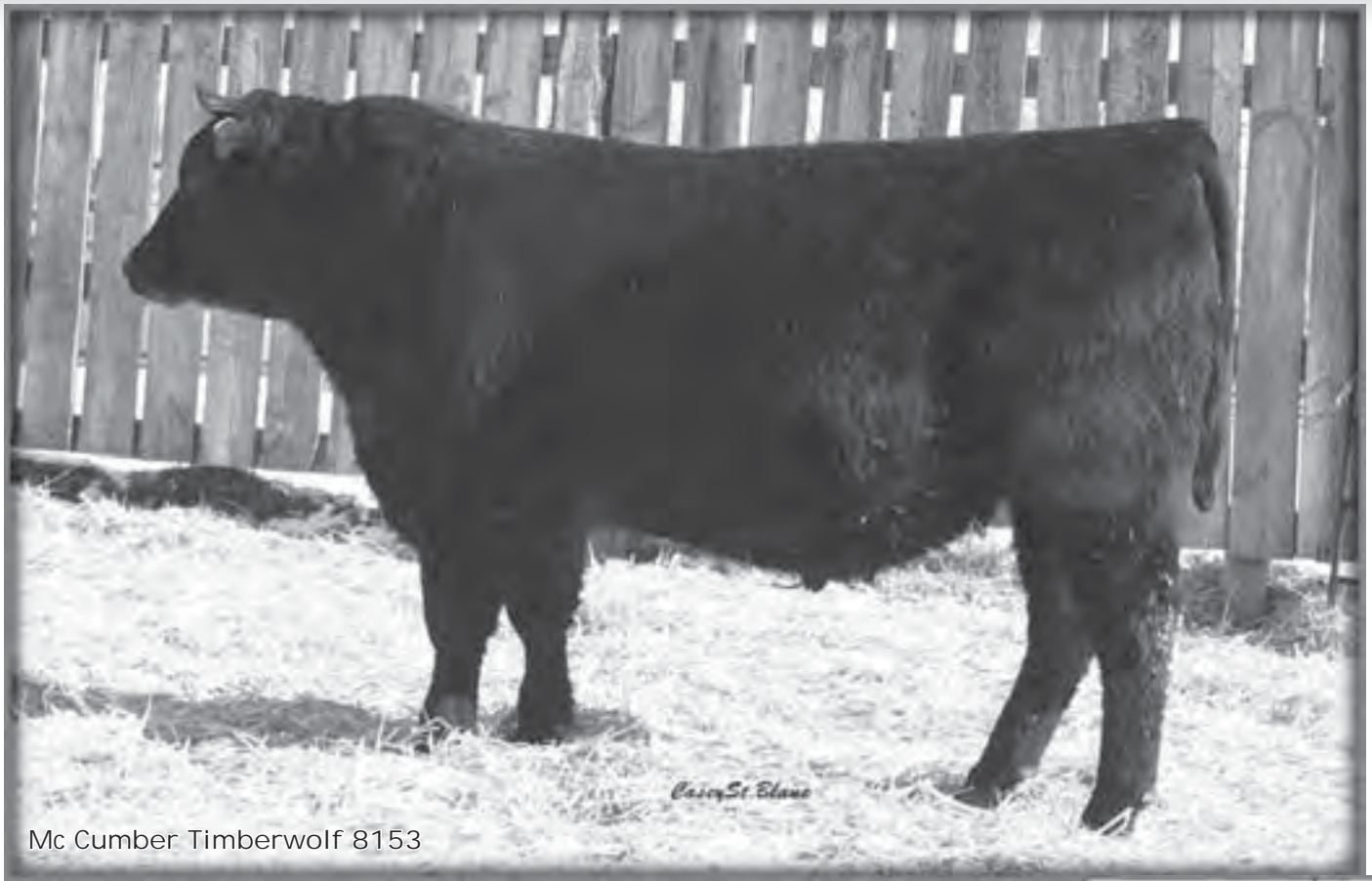
Mc Cumber Timberwolf 8153