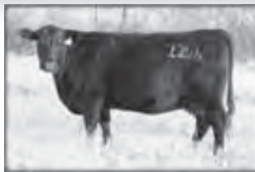
Dam of Lot 80.

Selling 2/3 interest and full possession- Recommended for use on heifers- Cow power and plenty of performance combine to make 8109 an intriguing calving ease prospect. 8109 earned a 205 day weight of 715 lbs. to ratio 102 as his dam's first calf. He is a free moving, good footed bull that is moderate framed, easy fleshing and full of libido. His dam is an outstanding uddered daughter of 004, and is currently nursing a super heifer calf by 536P. His grand dam is a top donor for us and the dam to the herd sire prospect selling as Lot 2 in this sale. 8109 traces to EXT 6 times in 7 generations.