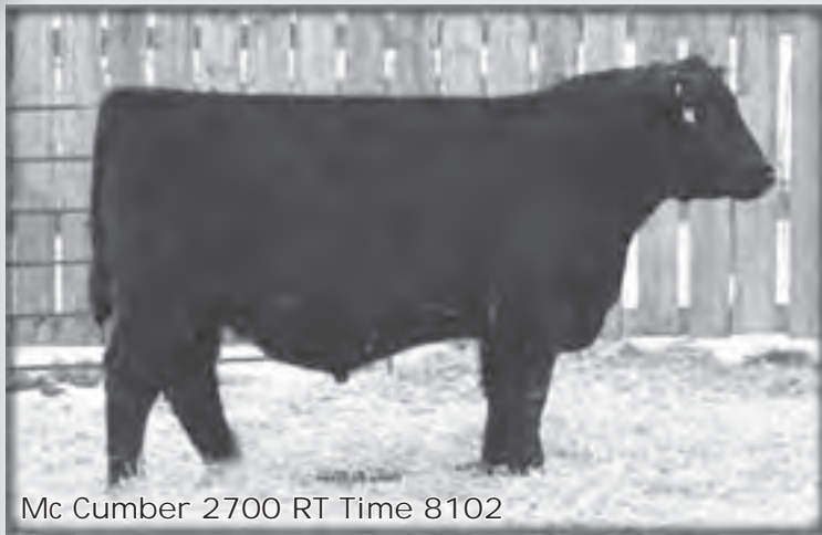
Mc Cumber 2700 RT Time 8102