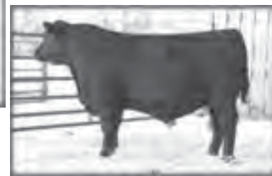
Maternal brother of Lot 80, 6120.