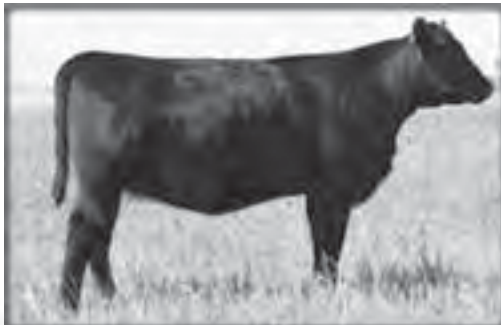
Maternal sister of Lot 11, B Pride 613 of Mc Cumber.

His dam has produced one other son that sold to Rustin Smith, and is working successfully in the desert country of Nevada. Her only daughter sold as a sale feature of our 2006 Female sale to Gary Leibrand in MT for $5250 as a weaned heifer calf. B Pride 404 is in our opinion near ideal in type. She is moderate framed, thick from end to end, high volume, and has a near perfect udder. She maintains her condition extremely well and has an excellent disposition. 8102 puts together an appealing body type with an outstanding maternal heritage, top notch performance, and a super disposition.