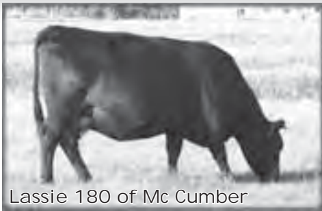
Lassie 180 of Mc Cumber