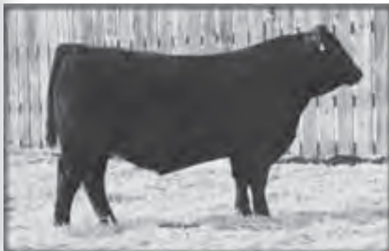
8144 is the maternal brother to Lot 18's dam.

Selling 2/3 interest and full possession- Recommended for use on heifers- This unique pedigreed calving ease prospect was one of the top weaning weight bulls of the calf crop. He earned a 205 day weight of 765 lbs. to ratio 109 without creep, as his dam's first calf. He performed well on test and recorded a 365 day weight of 1275 lbs. to ratio 107. 8161 is a son of Sinclair Extra Value 6PV20, who is a Net Present Value out of the dam to N Bar Primetime D806 that we purchased out of the 2007 Sinclair bull sale to clean-up our heifers. His dam is the top Boyd New Day daughter on the ranch, and is the first calf of B Pride 463, who is the dam of the herd bull prospect selling as Lot 5. B Pride 636 is a moderate framed, deep ribbed, excellent uddered female that maintains her flesh with ease. This moderated framed, thick made bull has a tremendous amount of libido and I would expect him to be able to cover a large group of females in any type of environment.