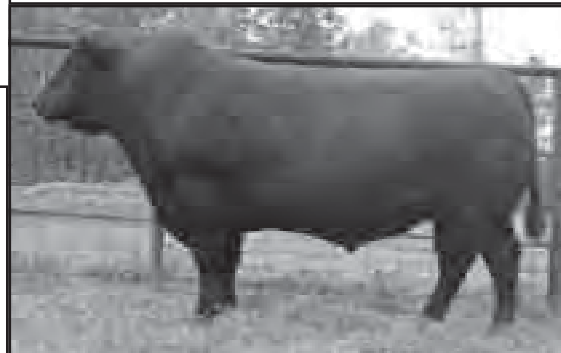
Mc Cumber Tradition 383 reg no 14667477 Right Time out of a Traveler 212. Moderate, deep and thick. Daughters have perfect udders

The Mc Cumber cattle are moder- ate framed, high volume ani- mals that possess the ability to flesh easily on pasture and high roughage rations. This is a very economically important trait in today's cattle business when considering the high cost of grain supplementation. Let “Mc Cumber” bulls help you enter the next era of effi- cient livestock production.