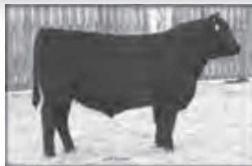
Maternal brothers to Lot 102.

Recommended for use on heifers- 8038 is a long, smooth shouldered son of 4x13. He has extra width and dimension to his rear quarter, and combines this with an IMF of 4.1 to ratio 112. His dam is a moderate framed, easy fleshing, perfect uddered of Mc Cumber 7078 VRD 3116. He has done a nice job for us siring moderate framed, easy fleshing, super uddered daughters and the males are thick, deep, and stout.