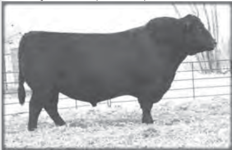
Sire of Lot 48.

This long bodied, smooth made son of 536P is big scrotaled, and excellent on his feet and legs. 8188 is a long striding, free moving bull that has a tremendous amount of eye appeal. He earned a 205 day weight of 729 lbs. to ratio 104, and recorded a 365 day weight of 1203 to ratio 101. His dam is an excellent uddered, deep bodied, thick made daughter of Pine Creek Right Time 1147. The 1147 daughters have been excellent cows and this one is no exception. We are really excited about the daughters of 536P, and reports back on the sons have been excellent. They are maintaining or gaining in condition while breeding cows and the dispositions are super.