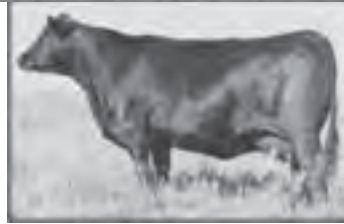
Clockwise from top: Dam of Lot 29, Grand dam of Lot 29 and Great grand dam of Lot 29