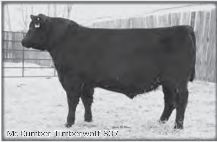
Mc Cumber Timberwolf 807