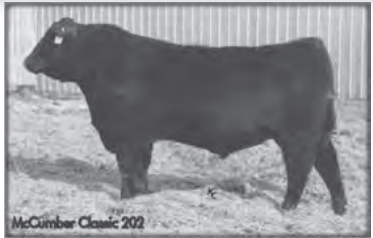
Maternal brother to grand dam.

Recommended for use on heifers- This unique pedigreed, moderate framed, heavy muscled, stout made bull performed well across the board. He had a gain ratio of 107 on a 42 mega cal ration and earned a 365 day weight of nearly 1200 lbs. Along with this he scanned outstanding with an IMF of 4.12, and a REA of 12.5 to ratio 111 and 107 respectively. 8181 is a dense muscled bull with more power and stoutness than you would expect from a calving ease bull. His dam is a moderate, easy fleshing, perfect uddered daughter of Boyd New Day and is currently nursing a phenomenal heifer calf by 4x13.