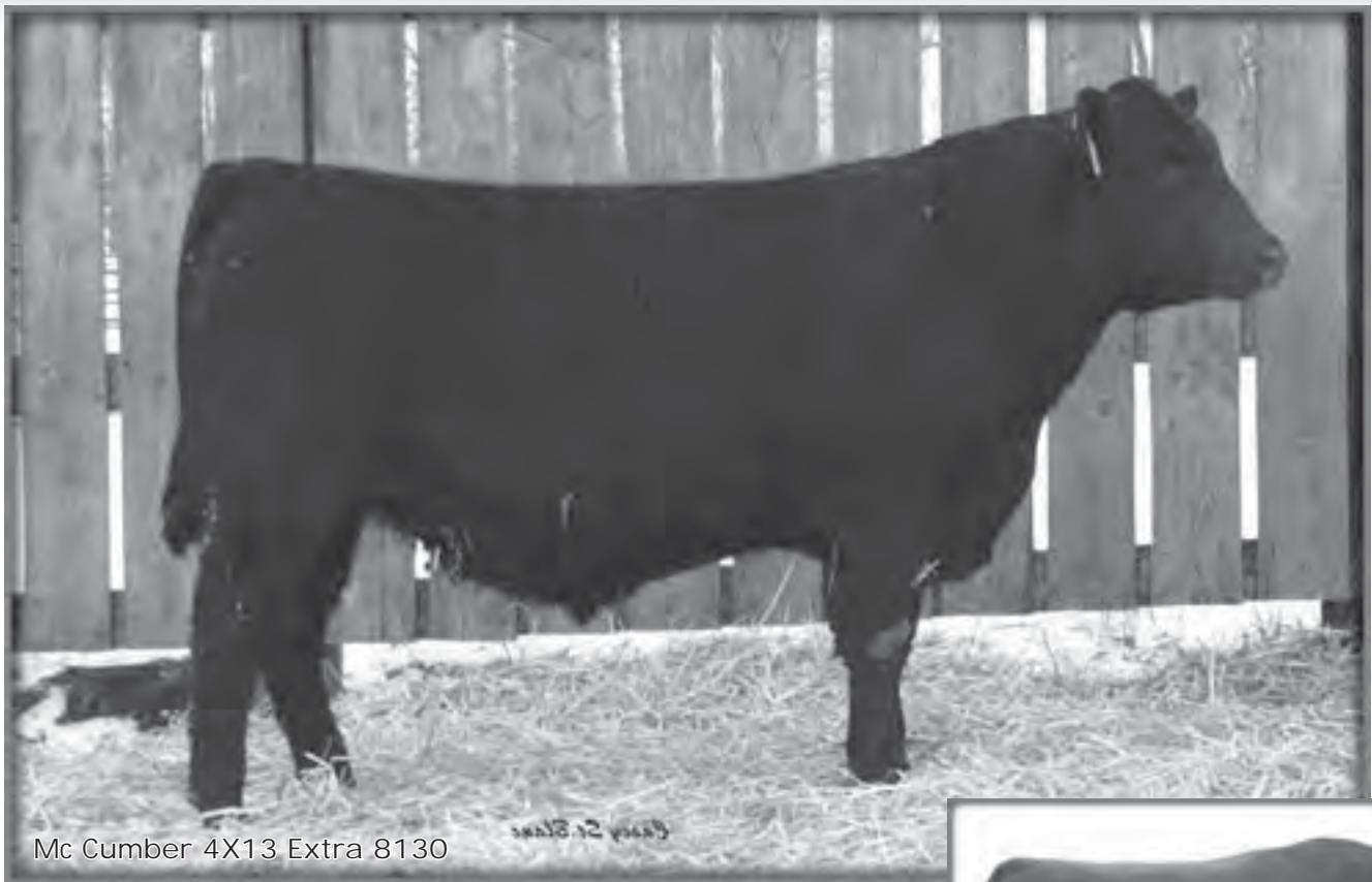
Mc Cumber 4X13 Extra 8130