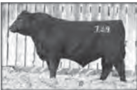
Maternal Brother to Lot 75.