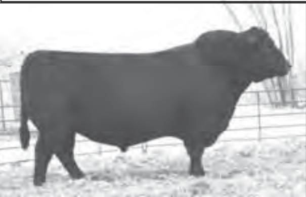
Sitz JLS Emulation EXT 536P reg no. 14809623 Ext out of a 6807. Sons are long, deep and muscular. First daughter have perfect udders with depth and femininity.

The Mc Cumber cattle are moder- ate framed, high volume ani- mals that possess the ability to flesh easily on pasture and high roughage rations. This is a very economically important trait in today's cattle business when considering the high cost of grain supplementation. Let “Mc Cumber” bulls help you enter the next era of effi- cient livestock production.