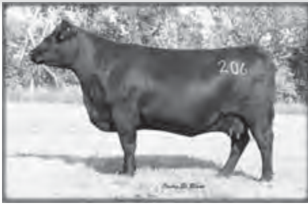
Flush sister to dam.