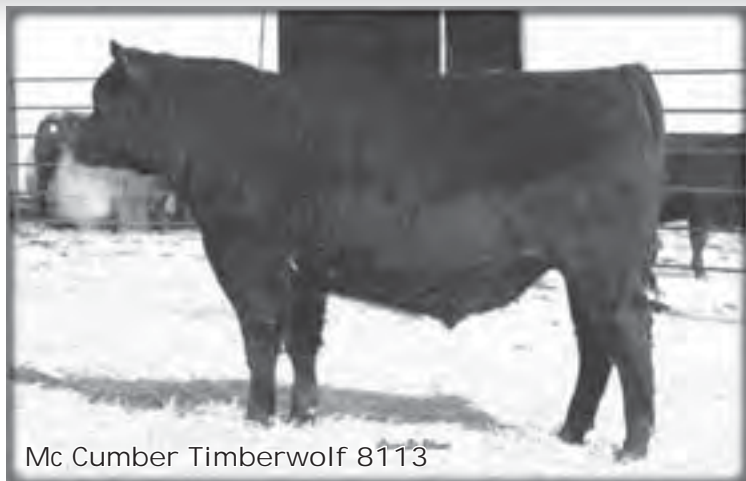
Mc Cumber Timberwolf 8113