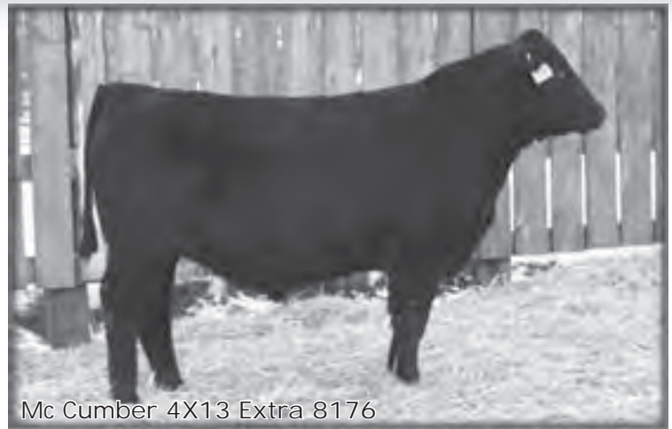
Mc Cumber 4X13 Extra 8176