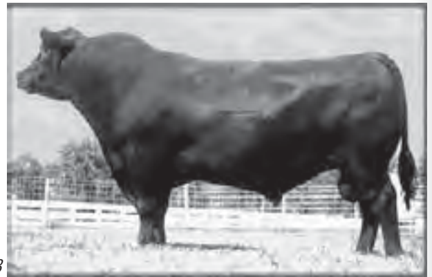
Leachman Right Time, sire of Lot 13