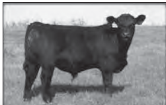
826 shown as a calf.

Selling 2/3 interest and full possession-Recommended for use on heifers- A near phenotypic replica of his sire Sinclair Extra 4X13. 826 is moderate framed, stout made, deep bodied, and long. He should be a sure shot heifer bull that started with only a 73 lb. BW and went on to wean off at 844 lbs. with a 205 day weight of 816 lbs. to ratio 117 as his dam's first calf. He earned a 365 day weight of 1304 lbs to ratio 110 and recorded the #3 IMF score of 5.63 to ratio 151. This earned him an IMF EPD of +.54 which ranks him in the top 15% of the breed for non-parent bulls. He has one of the top EPD profiles of any bull in the sale with a Calving Ease Direct of +12, BW EPD of -.8, WW EPD of +52, and YW EPD of +92. He also has a $W of +32.33 which ranks in the top 2% of the breed for non-parent bulls. His dam is a perfect uddered, easy fleshing member of the Lassie cow family. This unique son of 4x13 combines a moderate stature with outstanding early growth, sleep all night calving ease, and carcass quality.