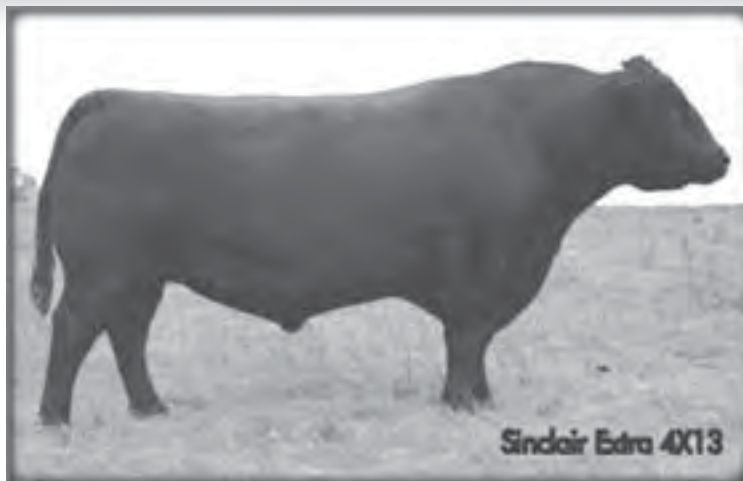
Sire of Lot 41.