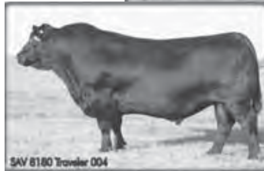
SAV 8180 Traveler 004