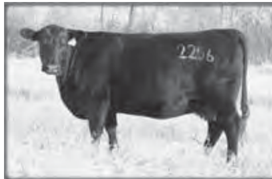
Right: Dam of Lot 35.