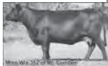
Great grand dam of Lot 1.