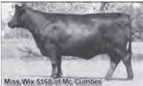
Above: Maternal grand dam of Lot 46. Right: Dam of Lot 47.