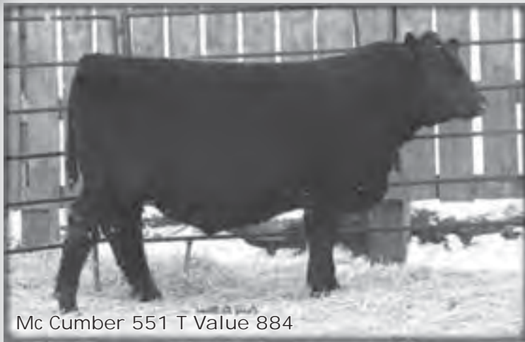
Mc Cumber 551 T Value 884