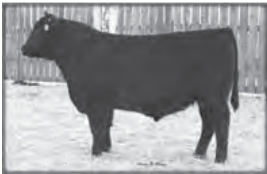
Maternal brother of Lot 96.

Selling 2/3 interest and full possession- Recommended for use on heifers- This is one of the flush brothers to the bulls selling as Lot 4, and Lot 102 in this sale. 8014 is long, moderate framed, smooth shouldered, and excellent on his feet and legs. His dam is a top Foundation daughter who not only is the dam of this outstanding flush of bulls, but produced a sale feature of our 2005 bull sale that sold for $7500. Cow-maker is an obvious way to describe 8014 as well as his flush brothers.