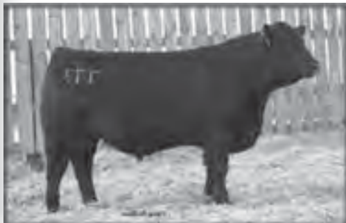
Maternal brother of Lot 14.

Selling 2/3 interest and full possession- 893 is a real meat wagon by 6120. He is a stout made beef bull with shape to his top, width and dimension to his rear end, and an abundance of rib and capacity. 893 broke the 800 lb. barrier at weaning and earned a 205 day weight of 748 lbs. to ratio 107. This 6120 sire group is an outstanding set of beef bulls with added performance, natural thickness, plenty of rib and consistently good from top to bottom. 893 has been favorite from the start and his dam is one of the very top cows in our herd. Blackcap 267 of Mc Cumber is a no miss female that is a high volume, thick made cow, with a near perfect udder, and excellent foot and leg structure. She has settled first service AI every year and has produced four progeny that have sold for an average of $4000. Her son last year sold as a sale feature to Joe and Gerald Bohl for $6750, and one of her daughters sold to Charles Dwyer in GA for $5500 through our 2006 Female sale. She is a pathfinder with a WWR of 5/108, YWR 5/108, and a calving interval of 6/366 days. We think 893 is one of the best bulls in this sale.