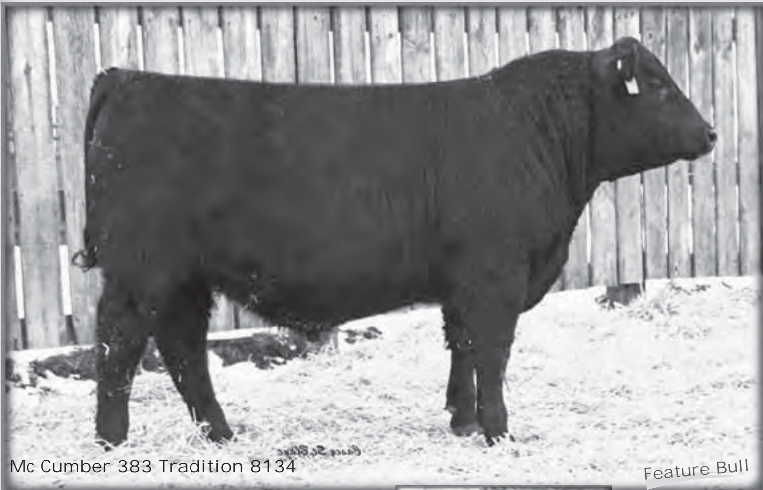
Mc Cumber 383 Tradition 8134