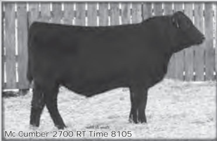
Mc Cumber 2700 RT Time 8105