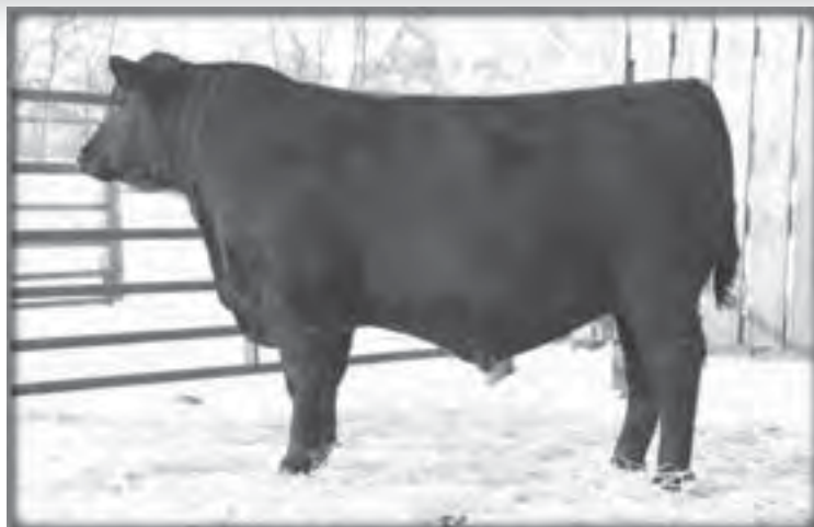
Above: Maternal brother of Lot 35.