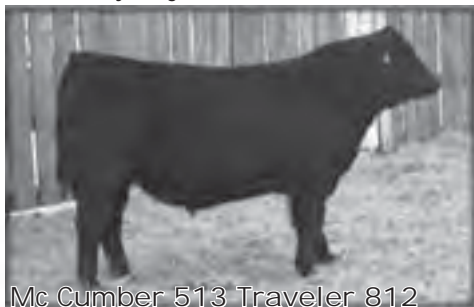
Mc Cumber 513 Traveler 812

Selling 2/3 interest and full possession- Recommended for use on heifers- This big rumped, super stylish son of Mc Cumber 004 Traveler 513 is sure to catch your eye. 812 should be a sure thing heifer bull with a BW of 72 lbs. CED of +12, and a BW EPD of -1.1. Along with this 812 weaned off with a 205 day weight of 703 lbs. to ratio 100 as his dam's first calf. He gained well on test with a gain ratio of 112, and earned a 365 day weight of 1253 lbs. to ratio 105. His dam is a perfect uddered, easy fleshing, moderate framed daughter of Sitz Triangle S Valubull 9802. 812 will surely catch your eye with his attractive profile, and extra muscle expression, but in addition to this he should be a sure thing on heifers, and have extra performance.