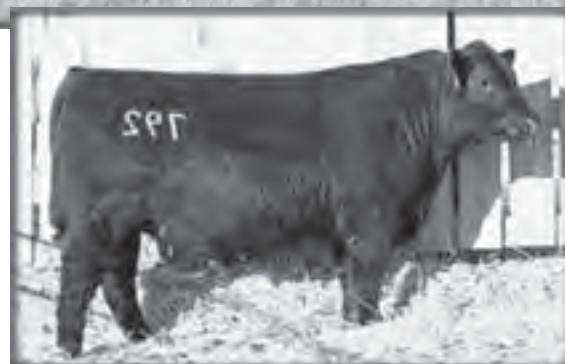
Above: dam of Lot 87. Right: maternal brother of Lot 87.