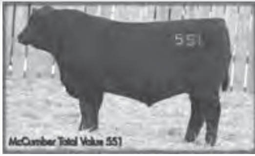
Sire of Lot 71.