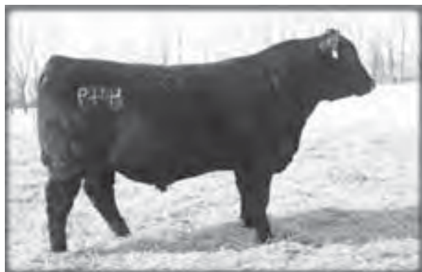
Brother to Lot 101.

This bigger framed son of Timberwolf moves with ease as he travels. His dam is a wide, made, deep bodied daughter of Mc Cumber New Trend 1206. He earned a 205 day weight of nearly 700 lbs. to ratio 102.