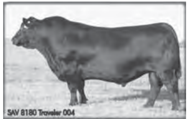
Lot: Grand sire of Lot 70.

Recommended for use on heifers- 842 is a little bit bigger framed son of 4x13, but weaned off his pathfinder dam at 808 lbs. and earned a WWR of 102. He scanned exceptionally well with an IMF of 3.83 to ratio 103, and had a REA of 12.7 to ratio 109. Along with this he had a REA/CWT of 1.16 and is large scrotumed, big topped, smooth shouldered bull. His pathfinder dam has never missed AI, and consistently adds REA to her progeny with a REA of 5/111. For those who like a little more frame, this 4x13 son may fit the bill.