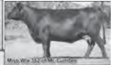
Miss Wix 352 of Mc Cumber