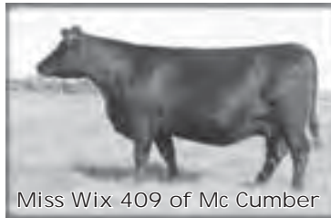
Miss Wix 409 of Mc Cumber