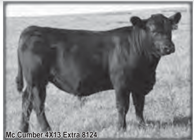
Mc Cumber 4X13 Extra 8124