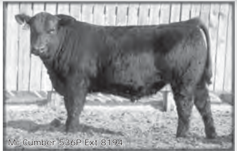
Mc Cumber 536P Ext 8194