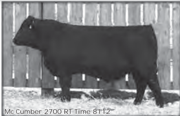
Mc Cumber 2700 RT Time 8112