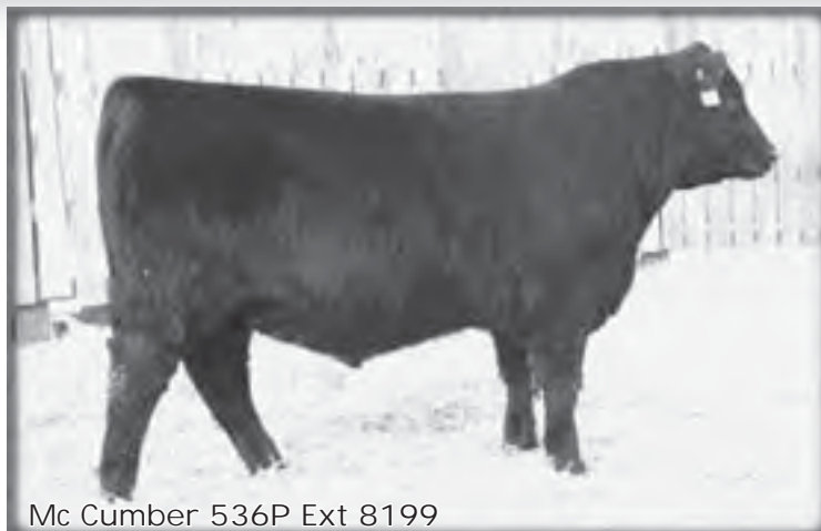
Mc Cumber 536P Ext 8199