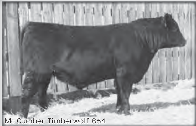
Mc Cumber Timberwolf 864