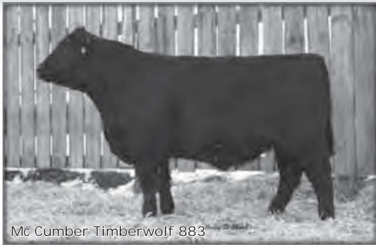
Mc Cumber Timberwolf 883