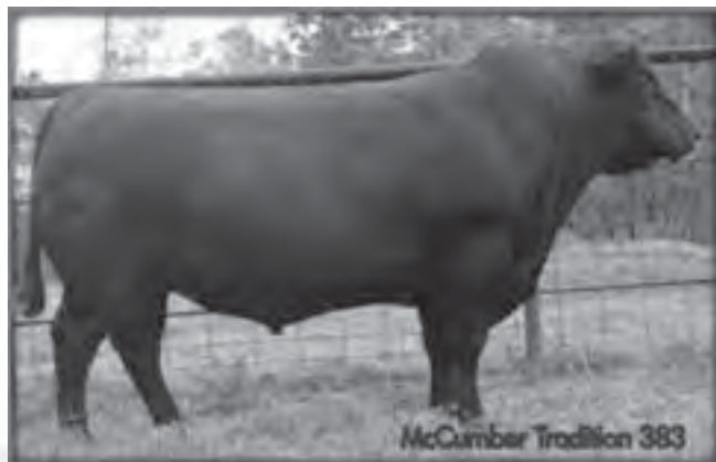
McCumber Tradition 383

Long bodied, smooth shouldered, and excellent on his feet and legs best describes this son of Mc Cumber Tradition 383. He weaned off his dam at 760 lbs. without creep and recorded an IMF of 4.69 to ratio 126. Along with this he had a REA/CWT of 1.12.