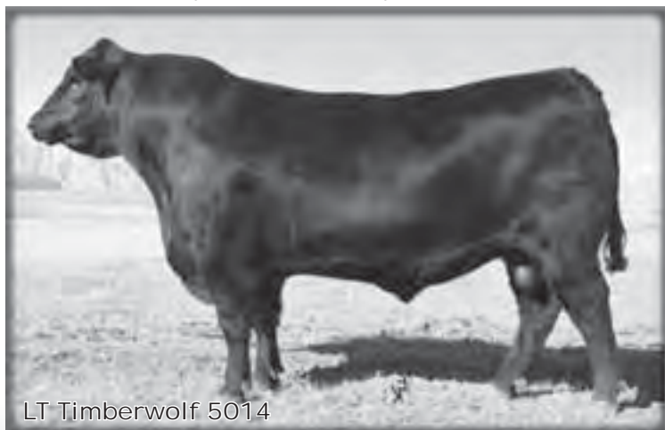
LT Timberwolf 5014

Selling 2/3 interest and full possession- Recommended for use on heifers- This calving ease herd bull prospect has excelled at every measure. 835 earned a 205 day weight of 725 lbs. to ratio 104, had a gain ratio of 110 and recorded a 365 day weight of 1266 lbs. to ratio 107. He shined on the ultrasound as well with an IMF score of 4.15 to ratio 112, and a REA of 12.7 to ratio 109. 835 not only performed well at every measure but he has extra shape to his top and rear quarter, along with a sound structure and attractive profile. His dam is an easy fleshing, perfect uddered daughter of BT Right Time 24J, and is off to a good start with a BWR 2/93, WWR 2/103, YWR 2/103, IMF 2/104, and REA 2/112. 835 will be easy to find come sale day.