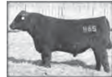
7181 & 465 are maternal brothers to dam of Lot 1.