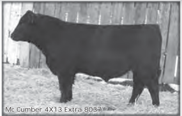
Mc Cumber 4X13 Extra 8037