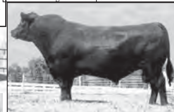
“Right Time” reg no 11750711 Many sons out of our very best females.

Please contact us to receive our Newsletters or Bull Sale Catalog.