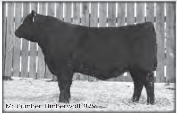
Mc Cumber Timberwolf 879

Selling 2/3 interest and full possession- This big, stout, rugged made son of Right Time has a tremendous amount of rib and capacity. He is thick through out and stands down wide and square on his feet and legs. He weaned off his outstanding dam a t 810 lbs. and earned a 205 day weight of 750 lbs. to ratio 107. He was one of the top gaining bulls on test with an ADG of 3.77 to ratio 123 on a 42 Mega Cal ration. He weighed off at nearly 1300 lbs. and recorded a 365 day weight of 1353 lbs. to ratio 114. His dam is an outstanding beef cow. Rosetta 1126 is a high volume, easy fleshing female with an excellent udder and outstanding feet and legs. She goes about her business year in and year out, by breeding early, and bringing in big, bloomy calves in the Fall. She has a WWR of 6/103, YWR 6/107, and a REA 6/105. She has produced 3 sons that have sold through previous bull sales to Marlin Reinhart, Bill Striefel, and Dan Birkeland. 8155 is the type of bull that can sire those heavy steers and females with the capacity to be efficient forage converters.