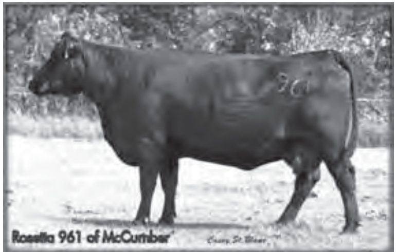
Grand dam of Lot 49.

Recommended for use on heifers- Moderate framed, deep ribbed and naturally thick best describes this calving ease son of Mc Cumber 209 T Value 551. This light birth weight bull weaned off at 752 lbs. and earned a 205 day weight of 734 lbs. to ratio 105. His dam is a long, smooth, feminine fronted daughter of Boyd New Day 8005 with an outstanding udder and a BWR 2/88, WWR 2/104, and YWR 2/100.