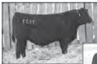
Maternal brother of Lot 5.