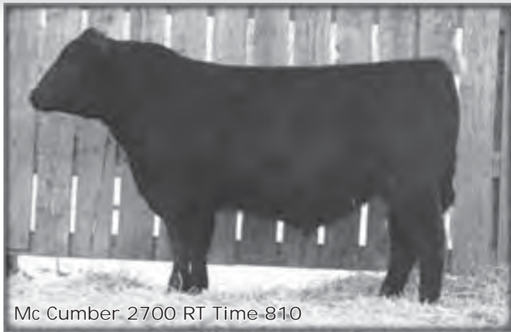
Mc Cumber 2700 RT Time 810