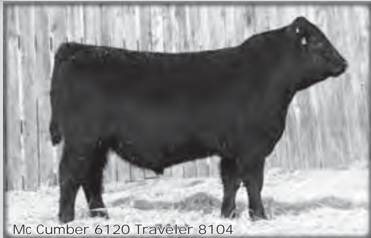
Mc Cumber 6120 Traveler 8104