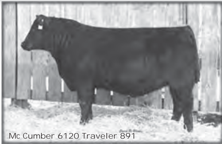
Mc Cumber 6120 Traveler 891