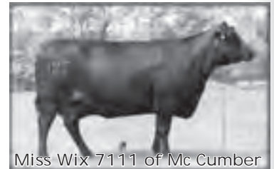
Miss Wix 7111 of Mc Cumber