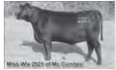
Miss Wix 2021 of Mc Cumber