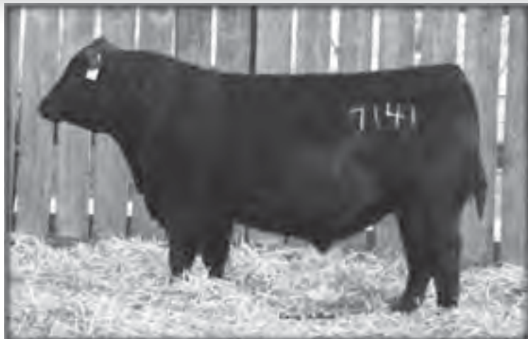
Lot: Above: Maternal brother of Lot 46.