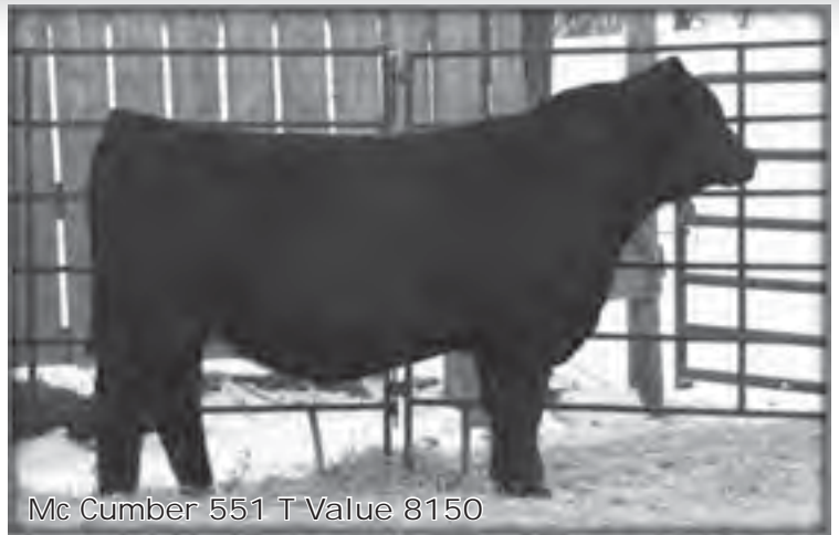
Mc Cumber 551 T Value 8150