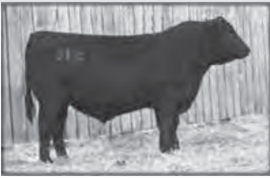
Maternal brother to dam of Lot 108.