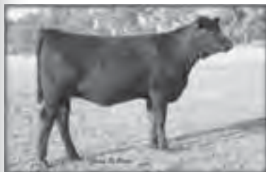
Dam of Lot 79, shown as heifer calf.

Extremely long bodied, extra smooth, and athletic in his movement best describes this Right Time son. He hit the 800 lb. mark at weaning and earned a 205 day weight of 721 to ratio 103. His dam and grand dam have never missed AI and his great grand dam is still in production for Sterling Land and Livestock in TX at the age of 17.