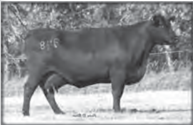
Gale 948, grand dam of Lot 28.

Here is a real load by Mc Cumber 209 Total Value 551. 884 is one of the deepest bodied bulls in this sale and combines that with a moderate frame, and natural thickness. He earned a 365 day weight of 1259 lbs. to ratio 106, had a gain ratio of 118 and ratioed 103 for IMF and 105 for REA. His dam is a high volume, good uddered daughter of Mc Cumber Powertrain 1025. She has never missed AI and has a WWR of 5/102, and a YWR of 4/104. Her only other son sold last year to Gary Johnson. His grand dam was a powerful daughter of 212 that sold to Tate Angus in LA as sale feature of our 2003 female sale.