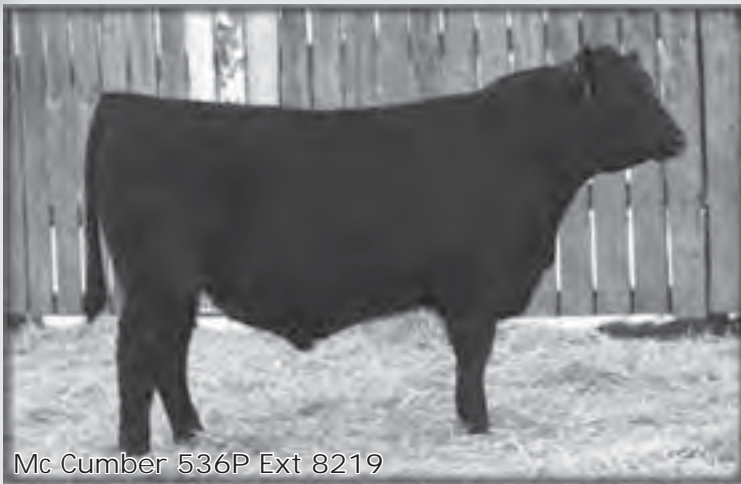
Mc Cumber 536P Ext 8219