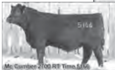
Mc Cumber 2700 RT Time 5148