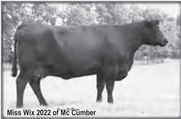
Miss Wix 2022 of Mc Cumber

The outstanding donor dam of this flush is Miss Wix 2022 of Mc Cumber. She is a powerful beef cow with tremendous fleshing ease, an abundance of volume, and excellent feet and legs. Her udder is what all other cows on this ranch are compared to. It is near perfect with small well placed teats, exceptional fore, and rear udder attachment, and is free of hair, and false teats. Her production has been outstanding. She has produced 5 sons that have sold for an average of $6000, and her only mature daughter in production has been superb. She is Miss Wix 409 who produced last year's high selling bull, and is the dam of the herd bull prospect selling as Lot 6 this year. 409 earned pathfinder this year, and is a testament of how this cow family consistently passes on outstanding fertility and top-notch production from generation to generation. Miss Wix 2022 is often a favorite of visitors to the ranch, and is very impressive from every angle. Her only 2 full sisters have topped our last two cow sales at $15,000, and $12,000 respectively to Fortune's Rafter U Cross Ranch in SD, and to TL Ranch in MO. The progeny produced by this line of cows have been adaptable to many environments and not only have included many of our top sellers, but the females have had the ability to pass on fertility, productivity, and longevity for many generations.