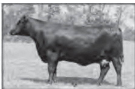
Great grand dam of Lot 39, Miss Wix 5007

This rugged, naturally thick, moderate framed son of Timberwolf nearly broke the 800 lb. barrier at weaning as his dam's first calf. 833 earned a 205 day weight of 771 lbs. to ratio 110, and recorded a 365 day weight of 1229 lbs. to ratio 103. His dam is an easy fleshing, deep bodied, thick made female that weaned off well over 50% of her body weight.