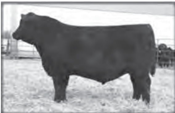
Maternal brother to dam.

Selling 2/3 interest and full possession- This big topped, stout rumped son of 6120 will impress you with his muscle definition. 891 is the #1 REA bull of the group with a 14.3 sq in. ribeye, which earned him a ratio of 122. Not only is 891 full of muscle but he is deep bodied, stout made, and sound on his feet and legs. He performed well across the board with a 205 day weight of 730 lbs. to ratio 104, a gain ratio of 116, and a 365 day weight of nearly 1300 lbs. to ratio 109. His dam is a moderate framed tank. She is easy fleshing, super uddered, and good footed. His Grand dam is one of the most powerful females on the ranch and produced the high gaining bull in last year's group. 891 has a little more birth weight, but put him on your cows and I would expect him to sire heavy muscled, shapely calves that will command top dollar come sale time.