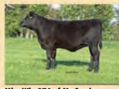
Miss Wix 974 of Mc Cumber She is from the first sire group of Sitz Rainmaker 6536 that we choose to represent him in this sale. They are very broody with abundant capacity.