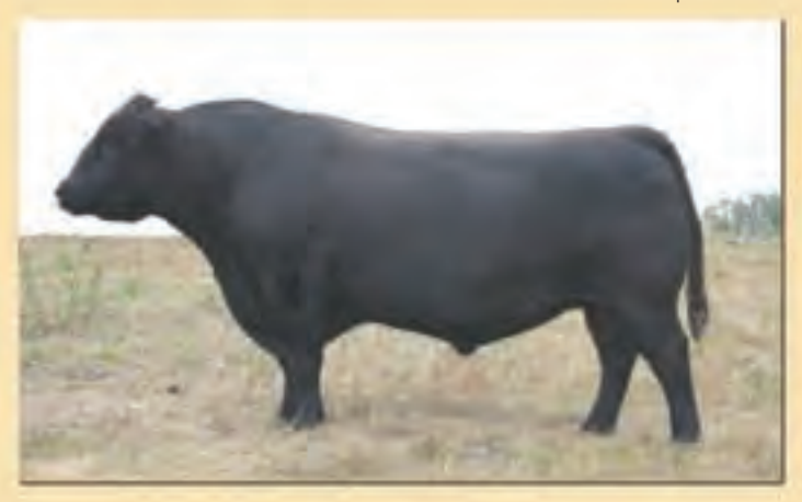
Sinclair Extra 4X13 by EXT