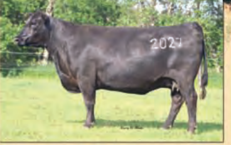
Miss Wix 2027 of Mc Cumber # 14219959 • DOB 1/23/02 A sixth consecutive pathfinder dam and donor for Mc Cumber.