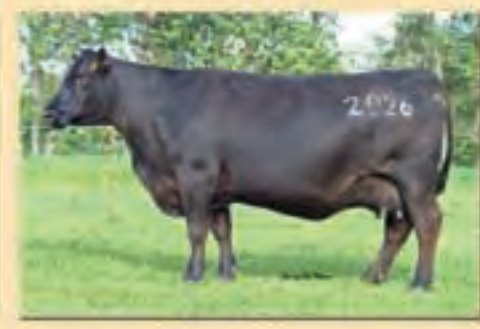
Miss Wix 2026 of Mc Cumber A VRD daughter and out of a Rito 054 dam.