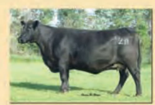
Gale 120 of Mc Cumber by Foundation 701