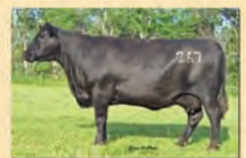
Lassie 267 of Mc Cumber by Pine Creek Right Time 1147