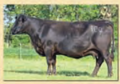
Lassie 180 of Mc Cumber by Foundation 701