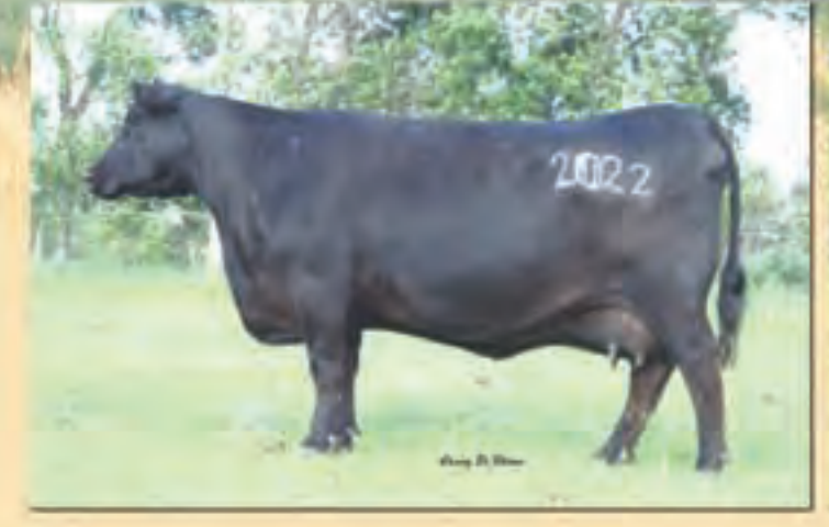
Miss Wix 2022 of Mc Cumber #14201203 • DOB 1/28/02 An elite female that has been a donor at Mc Cumber.