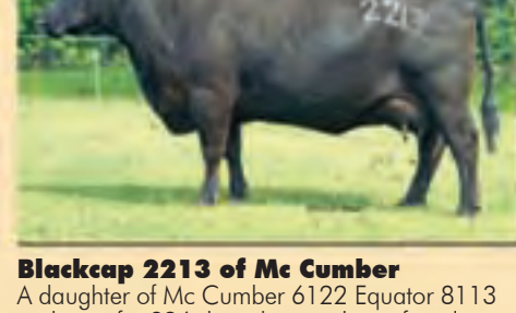
and out of a 326 dam she is a donor females at Mc Cumber.