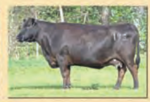
Miss Wix 193 of Mc Cumber by Foundation 701