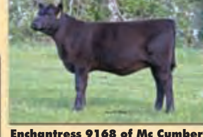
Enchantress 9168 of Mc Cumber This daughter of 4X13 sells Oct. 29. She Mc Cumber 004 Traveler 6120 Mc Cumber 6120 Traveler 8144 is very feminine and will be an outstanding female. The 4X13 daughters are excellent, moderate-framed young females with