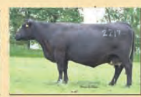
B Pride 2219 of Mc Cumber by BT New Trend 172K