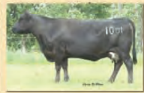
Miss Wix 1001 of Mc Cumber by Traveler 23-4