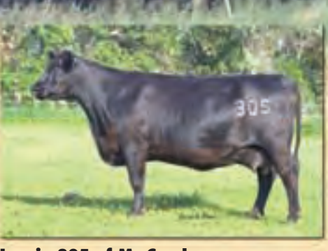
Lassie 305 of Mc Cumber Another Right Time daughter out of a 8113 dam.