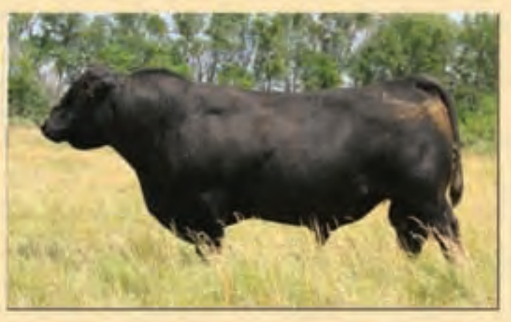
OCC Tremendous 619T by Emblazon