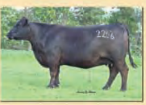
Erianna 2206 of Mc Cumber