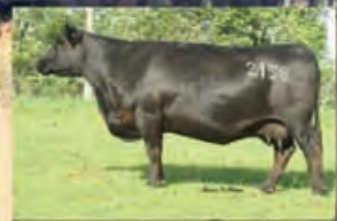
Lassie 2158 ofMc Cumber A Right Time daughter and flush sister to Lassie 206 of Mc Cumber