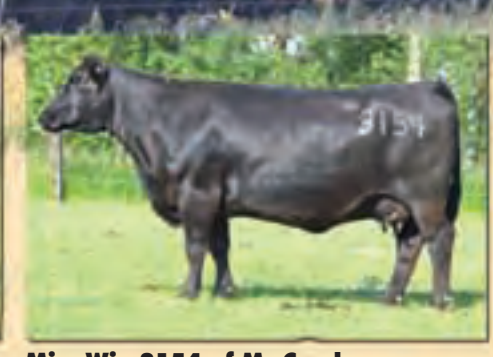
Miss Wix 3154 of Mc Cumber A daughter of Right Time 24J.