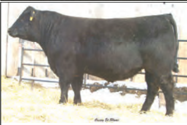
Mc Cumber 4X13 Extra 829 A grandson of Miss Wix 2027 of Mc Cumber who was lot 1 in the 2009 Mc Cumber bull sale. Owned with Wight Angus in ID. 829's first sons will sell on March 23,2011

The highest marbling son of EXT produced by Sinclair Cattle Co. 4X13 traces 38 times to Emulation 31 and is backed by 8 generations of calving ease dams. 4X13 is the most consistent sire of calving ease and phenotype, bar none, that we have ever used. Sons are moderate framed, long, deep bodied with a wide stance and correct hoof and leg structure. They are consistently the top IMF bulls in the pen. His daughters are beautifully patterned cows with beautiful udders. They are feminine and clean through their throat latch, with length and depth of body in a moderate frame. They have excellent mothering instincts. They want to have a calf, get it up and nursing quickly. 4X13 daughters raise many of the top nursing ratio calves year after year. A complete bull that has produced many sons that are herd bulls here at Mc Cumper and for other breeders around the country. Many sons and grandsons will sell March 23, 2011 at Mc Cumber.