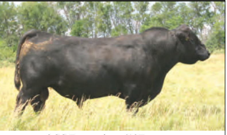
OCC Tremendous 619T Sired by Emblazon and out of an Anchor dam with an EXT maternal grand dam. Genetics that work for the grass feds.