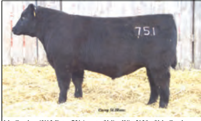
Mc Cumber 4X13 Extra 751 is out of Miss Wix 5139 of Mc Cumber, sired by 24J, and is a granddaughter of Miss Wix 365 of Mc Cumber. 751 is a calving ease sire. Owned with Nelson Angus, ID.