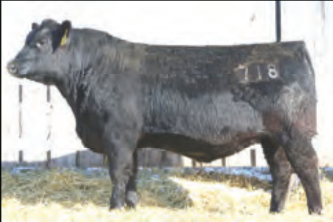
Mc Cumber 4X13 Extra 718 A grandson of Miss Wix 2022 of Mc Cumber that was the top selling bull in the 2008 Mc Cumber bull sale. Owned with Currant Creek Angus and U Cross Ranch in MT