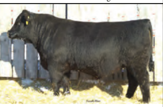
Mc Cumber Missing Link 911 A Missing Link son that exhibits the depth, thickness and power that Missing Link sires. Missing Link is a calving ease sire.