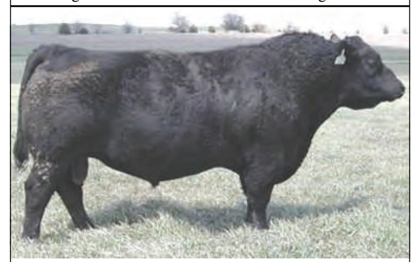
OCC Missing Link 830M