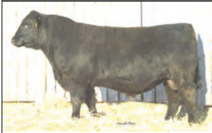
Mc Cumber 4X13 Extra 975 is an exciting son of 4X13 and out of B Pride 463 of Mc Cumber who is a granddaughter of Right time. 975 was our Lot 1 bull in 2010 selling to Haugen Angus, ND